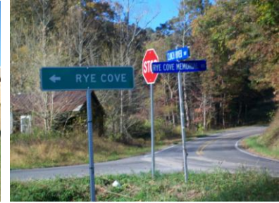
Possible site for wayside exhibit