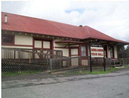
Depot converted into Town Hall