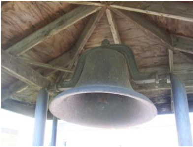
Bell from the Rye Cove School