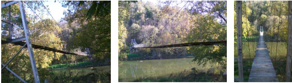
Photos of the swinging bridge off Hwy 65 and visible from the byway.