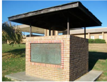
Memorial of the Tragedy