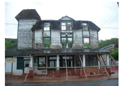
Pocahontas Company Store

It is also strongly recommended that a downtown historic walking tour be developed which starts at the Pocahontas Company Store. For more on this, see Chapter VII: Addressing the Issues on developing walking and driving tours.