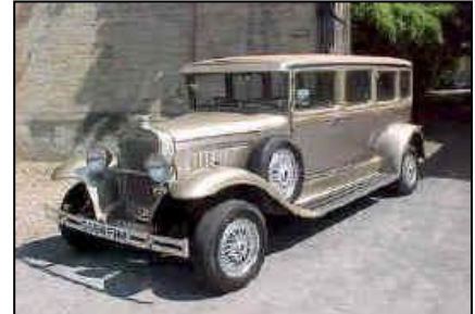
Vintage Car Driving Tour is recommended

The proposed passenger train connecting Pocahontas to Bramwell was addressed as well as some alternative transportation opportunities such as a trolley to connect the two towns together until the railroad track is replaced and the route reopened.