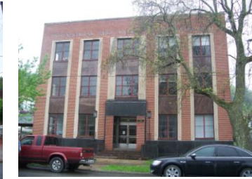
Pocahontas Fuel Company Building