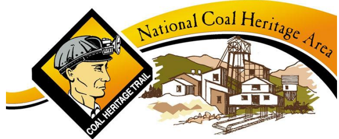
West Virginia's Coal Heritage Trail Logo

For more on uniform signage and creating a recognizable logo, see Chapter X: Walking/Driving Tours and Chapter Y: Marketing the Trail.