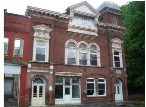
Opera House & City Hall

A downtown driving tour was also suggested using 1920's vintage cars and horse-drawn carriages. The passing of a law to allow golf carts on city streets opens the opportunity to offer this mode of transportation as well. A wagon ride was also suggested as it was noted that Pocahontas once had a number of stables.