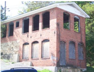
Sylvan Fox office