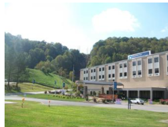
Hospital built on bench