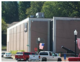
Building built on coal seam