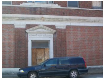
Kimmerer Building Coal office