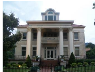
Coal Co. President's Home