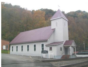
Dante Church next to track

Do note, the Dante Church main entrance is located even closer to the live track and this has never been an issue. The Depot in Coeburn is also located next to a live track but is used daily as offices and meeting space for those in the Coeburn Community. Why could the doors facing the track be sealed and a small fence erected on either end of the back side of the Depot to prevent any concerns about the track.