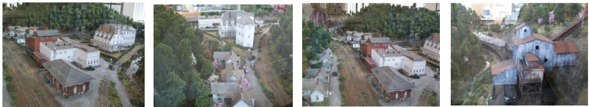
Clinchfield Coal Company once owned everything in Dante shown in this model of the town.