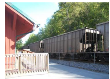
Depot in Coeburn next to a live track and used daily.

Action needs to be taken immediately to work something out to save the Depot. The depot is an intricate part of the story the town is trying to tell.