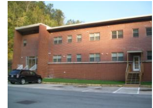
Above are some of the remaining buildings and structures including the Dante Post Office.

Note: The building to the far right is a housing facility built by People's Inc. on the site of the elementary school. They have also talked about opening a small shop and snack stand.