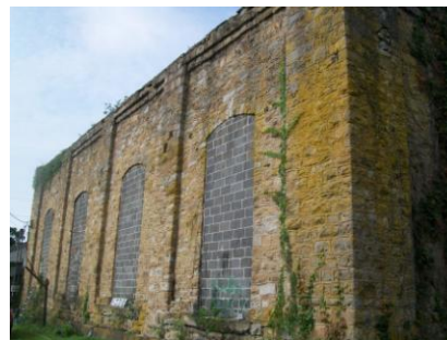
The Power Plant was later converted into a theater.