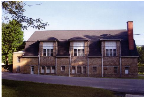
The old Company Store is now a gymnasium