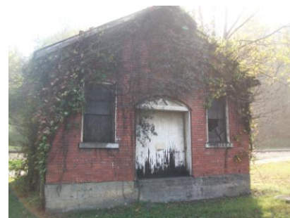
A few of the buildings still remain.