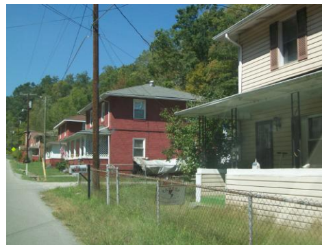
A few photos of Derby today