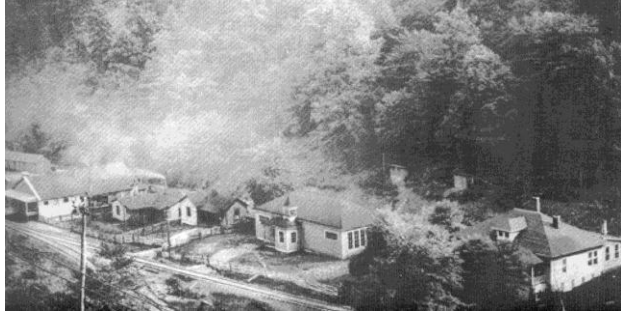
Pardee was used as the town in the filming of "Coal Miner's Daughter".

Pardee grew during the peak of the region's coke production. Based on access to a very clean coal seam of over ten feet, the town became profitable very quickly and grew in size. Up until the 1910s Pardee was one of the most isolated of the region's coal communities. The town was equipped with more than a hundred four room duplex style houses separated by an interior wall and a shared front porch. The town suffered through the Depression but rebounded during WWII. It went into slow decline in the 1960s and 1970s. The town did enjoy a brief resurgence in the 1980s with the filming and release of Coal Miner's Daughter . Some years after the movie, the town was completely destroyed and the landscape is completely dedicated to mining.