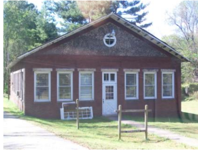
Old structures are located next to new mining operations.