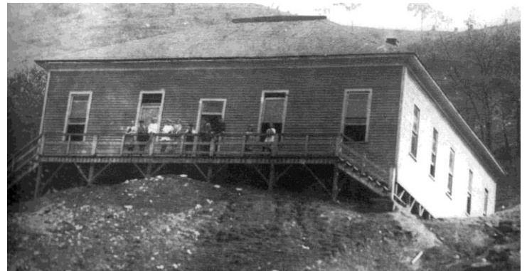
Dorchester School House

There was a 6-room building erected in 1923 to make a hospital, but they ended up not needing it so it became a school. Their baseball team was very popular and hundreds, sometimes thousands of people came to watch. The post office was established in 1895. Electricity was provided by the Norton Coal Company until 1914-1915 when a power plant was built to furnish power for Dorchester.