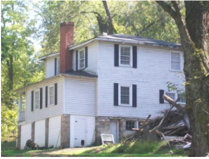
One of the homes still remaining.