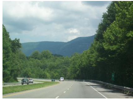
Hwy 58 in Lee County