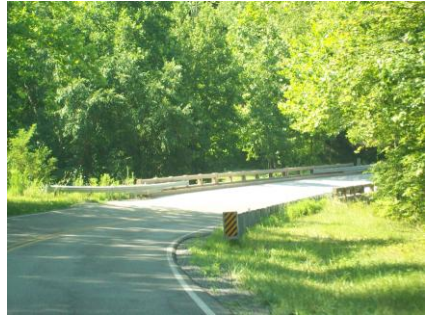
View on Hwy 380 in Buchanan County View in Russell County on Hwy 65