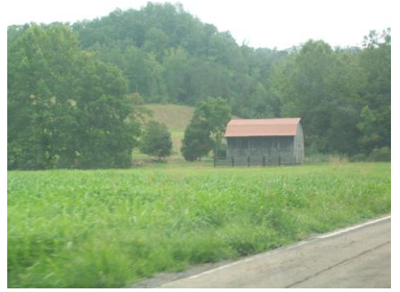
View on Hwy 65 in Scott County