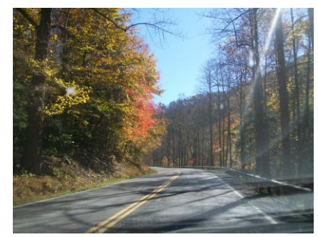
View on Hwy 606 in Lee County