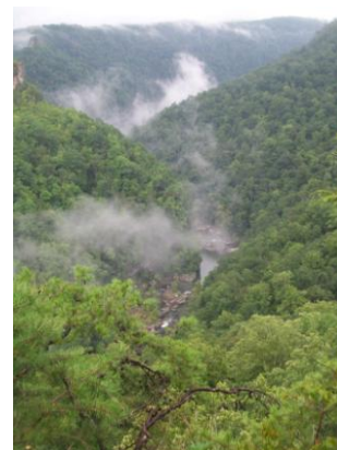
Rapids at Russell Fork (Russell & Dickenson Counties)