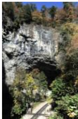
Natural Tunnel (Scott Co.)