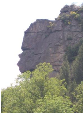
Stone Face (Lee Co.)

For a complete list and more details of all Virginia Scenic rivers and its program, see Virginia Outdoors Plan Chapter VII-F Scenic Rivers (PDF), pages 152-160.