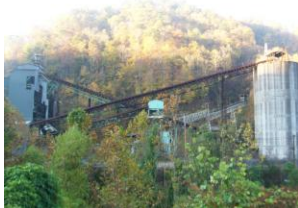
Site from beside the carwash in Vansant which would be an excellent location for visitors to pull over and view coal mining activity.