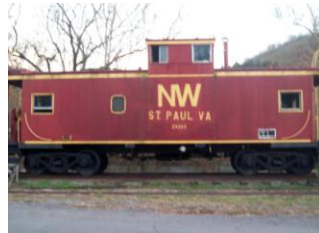
Caboose on display in St. Paul