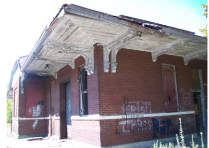
Three views of the passenger depot in Appalachia VA.