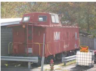
This caboose is currently located in downtown Appalachia.

The NW Caboose to the left is scheduled to be refurbished soon and moved to a vacant lot near the Bee Rock Tunnel between Appalachia and Big Stone Gap where it will become a visitor information center for the trail system being developed.