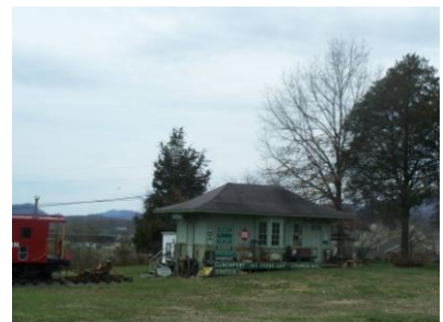
A railroad museum in Duffield is in a depot from a movie set

But where there were once a depot in nearly every community, there are now only six along the 325 mile route, four of which are noted above. The others are at risk of being lost forever. They include the Duffield Depot which has actually been moved from its original location and is being used as a storage shed in an area outside the region, the depot at Dante which is scheduled for demolition and the Appalachia passenger depot which is currently landlocked and in need of repair. Actually the town of Appalachia has two depots. One was for passengers and the other was used for freight. These four depots are featured on the following page. For more on this, see "Sites at Risk" later in this chapter.