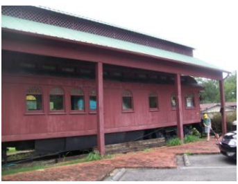
Visitor Center in Big Stone Gap

The visitor center in Big Stone Gap was once a private rail car used by the president of the railroad and is one of the oldest and finest examples of typical passenger car construction of the late 19 th century. Built in 1870 for the South Carolina & Georgia Railroad, it contains an observation room, two staterooms, a dining area and facilities for the porter and a kitchen area. Most of the original fixtures are intact, including the lavatories, lighting fixtures, and even the speedometer in the rear observation room.