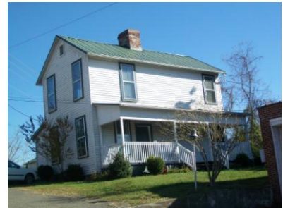
Railroad Section Manager's Home