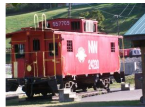
Caboose in Coeburn

The NW Caboose to the left is scheduled to be refurbished soon and moved to a vacant lot near the Bee Rock Tunnel between Appalachia and Big Stone Gap where it will become a visitor information center for the trail system being developed.