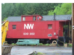
Caboose on display in Pocahontas