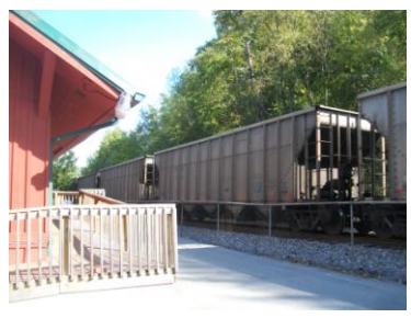
Live tracks next to the depot

One example of a converted depot being used by the community for offices and meeting space yet is located next to a live track is the Coeburn depot. They had a fence erected that separate the tracks from the structure.