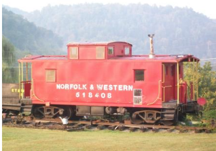
Caboose at Duffield

Rail cars are also being used for other purposes along the trail which have helped to preserve them for future generation. The Coal Heritage Trail Train museum just outside of the town of Haysi is housed in an old rail car. And two cabooses next door are used for lodging for the Red Caboose Bed & Breakfast. The Railroad Museum in Duffield houses some of its railroad memorabilia in Norfolk & Western caboose. There is also a rail car featured at the park in Coeburn and Pennington Gap has plans to convert their Southern caboose into an interpretive visitor information center for the Virginia Coal Heritage Trail.