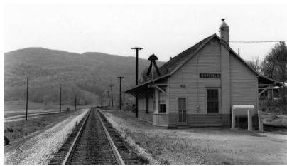
Duffield depot and depot in Dante are both at risk.