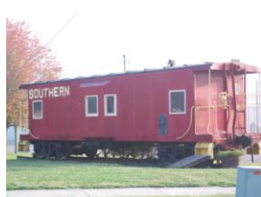
Future Information Center in Pennington Gap