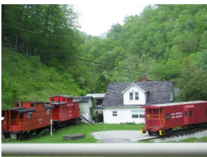
Red Caboose B&B and Coal Museum near Haysi

The visitor center in Big Stone Gap was once a private rail car used by the president of the railroad and is one of the oldest and finest examples of typical passenger car construction of the late 19 th century. Built in 1870 for the South Carolina & Georgia Railroad, it contains an observation room, two staterooms, a dining area and facilities for the porter and a kitchen area. Most of the original fixtures are intact, including the lavatories, lighting fixtures, and even the speedometer in the rear observation room.