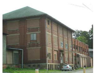
Appalachia still has its passenger and freight depot