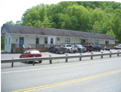
Fremont Depot – Offices