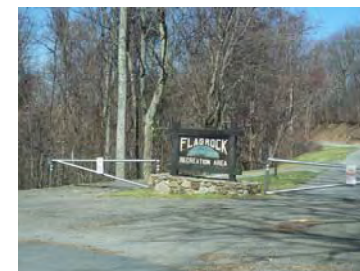
3) Flag Rock Recreation Area