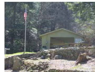
1) Legion Park Trailhead