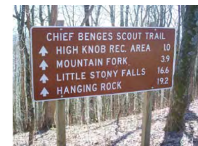
5) High Knob Tower and Chief Benge Scout Trail Trailhead