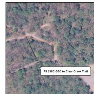
4) GSC Trailhead