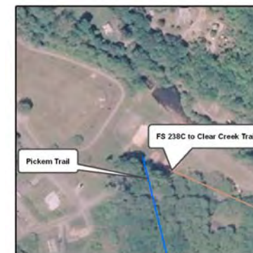
2) Clear Creek Trailhead