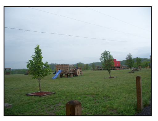
Recreational facility, pavilions, restroom facilities and garages.