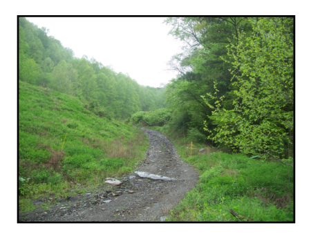
A side trip accessible from the proposed route takes one onto more rugged trails.

To the left is a section near the start of the trail which is quite wide and could serve as a trailhead so that one would not find it necessary to ride on VA 83. If that occurs, a larger area will need to be graveled to accommodate additional parking.