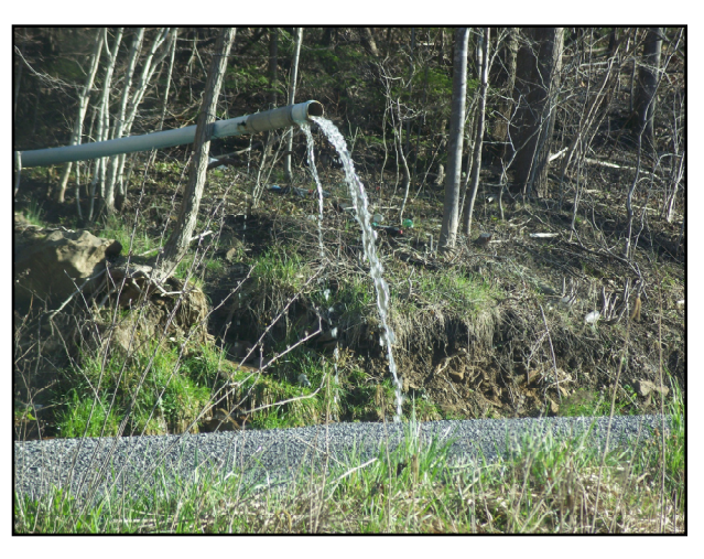
A unique feature along the route occurs at the intersection of Rt. 636 and Rt. 613 where a pipe protrudes and water flows year-round. This has been a major water source for residents in both Virginia and West Virginia for years.