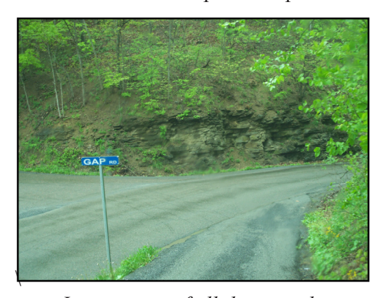
Intersection of all three roads

Across Lover's Gap is Gap Road which leads to another access point to the trail system networking across the mountain through Buchanan County