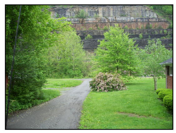
Trail is viewable and accesses driveway of a residential home.