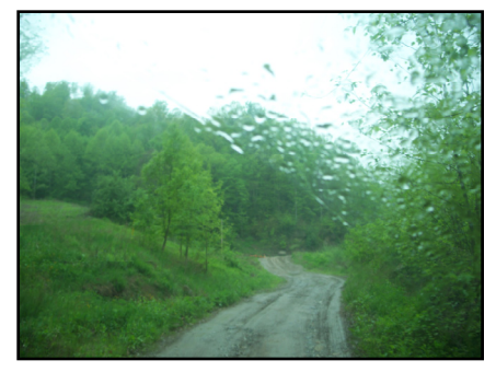
Portions of trail follows a gas road. Excellent condition. Quite wide and meandering.