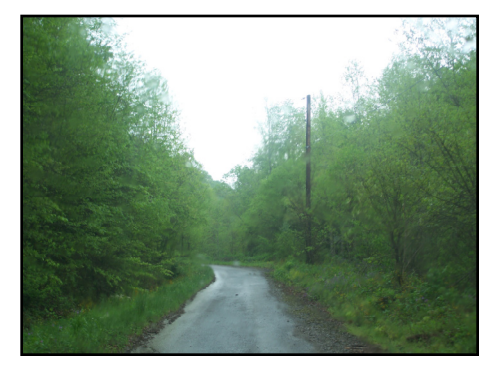
Trail passes a couple of homes on an asphalt road for less than a 1/10th of a mile then turns to a gravel road.