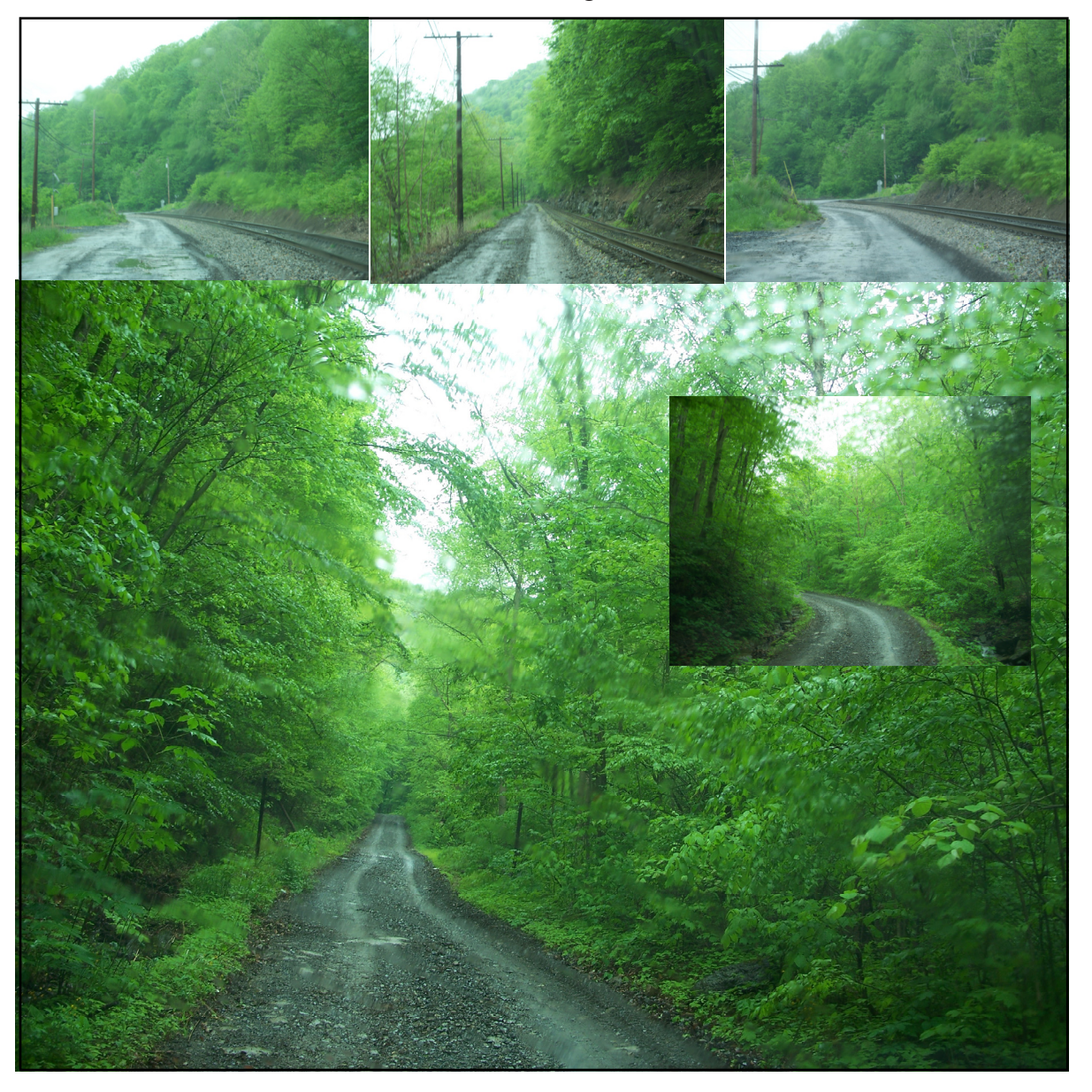
Below are views of Rt. 698 that connects U.S. 460 to the trails.