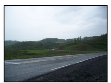
Note: Excellent roads lead into proposed trailhead.