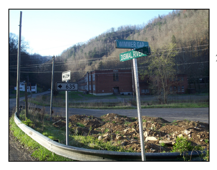
The intersection of Rt. 635 and Rt. 628 near Whitewood in Buchanan County in another meeting place for those interested in trail riding.

Bear Wallow near the intersection of Rt. 637 and Rt. 616 (which runs along the Buchanan/Tazewell county line) is another popular area to ride ATV. Trails from this area connect with trails in West Virginia.