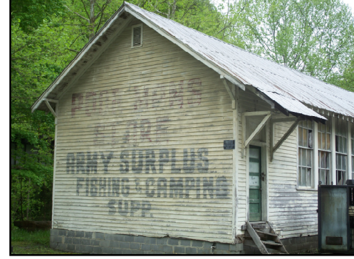
Interesting historic building along U.S. 460. Consideration needs to be made in preserving this structure and possibly turning it into a visitor center/museum, general store, or restaurant.