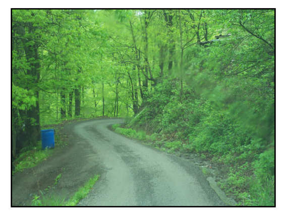
Gap Road climbs a steep, windy hill past one or two residential homes.