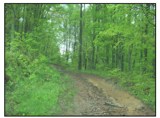
Gap Road ends at the trailhead.