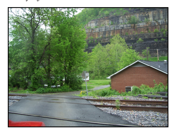
View heading south towards trail access on Rt. 732 View heading north towards Grundy from trail

Hwy 460 which is the major road through the Town of Grundy intersects with Rt. 732.