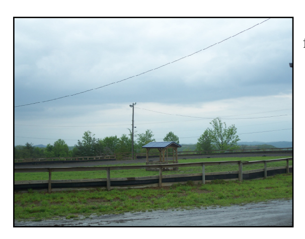
View of proposed 2nd trailhead from the recreation area described above.

Very large riding ring with bleachers and other facilities. Used for many equestrian events throughout the year.