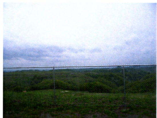
View of proposed 2 nd trailhead from the recreation area described above.