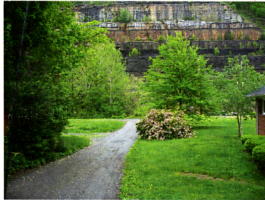
Trail is viewable and accesses driveway of a residential home.