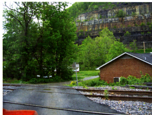
View heading north towards Grundy from trail

Hwy 460 which is the major road through the Town of Grundy intersects with Rt. 732.