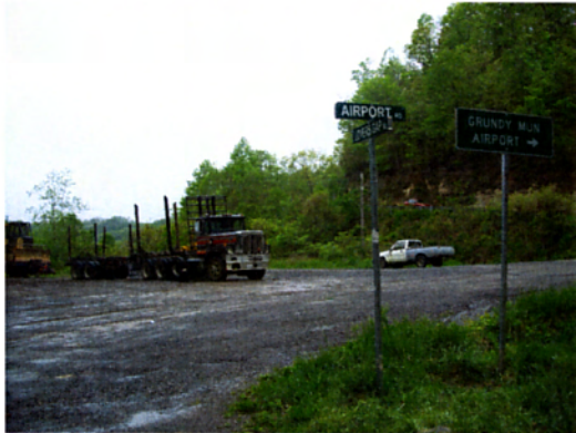
Intersection of Airport Rd & Gap Road

Coming off the mountain, one comes to the intersection of Lover's Gap and Airport Road.