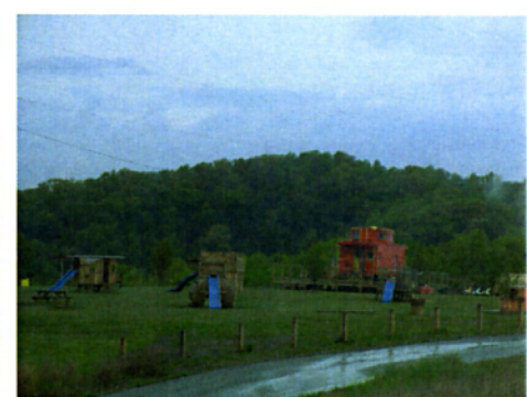
Playground area with covered picnic areas and multiple apparatus for children to play.