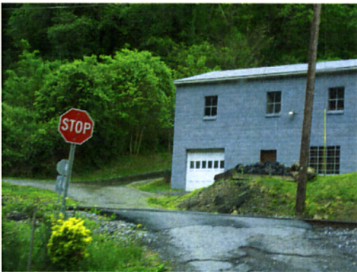
View heading south towards trail access on Rt. 732