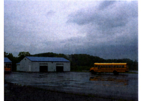
Recreational facility, pavilions, restroom facilities and garages