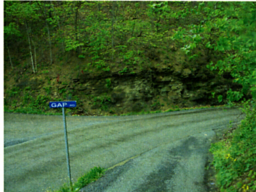
Intersection of all three roads

Across Lover's Gap is Gap Road which leads to another access point to the trail system networking across the mountain through Buchanan County