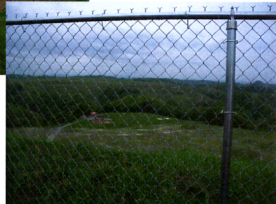
View looking down onto proposed Trailhead #2

The flat lay of the land, along with the access to restroom facilities, electricity and other amenities makes this an ideal location for a future ATV trailhead and full hook-up campground.