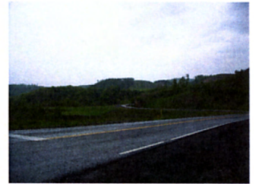
Note: Excellent roads leading into proposed trailhead.