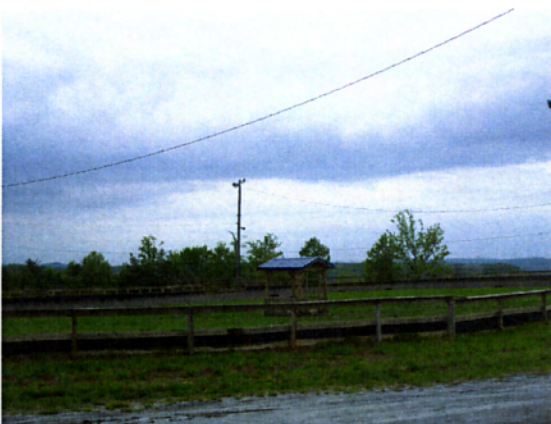
Very large riding ring with bleachers and other facilities. Used for many equestrian events throughout the year.