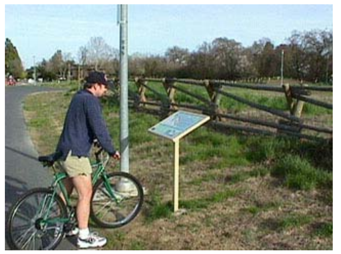
Interpretive signs should be added at points of interest along both SC 46 and the pedestrian/bike path