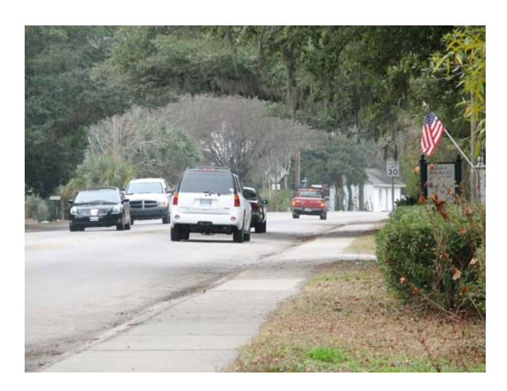
Canopy within Old Town