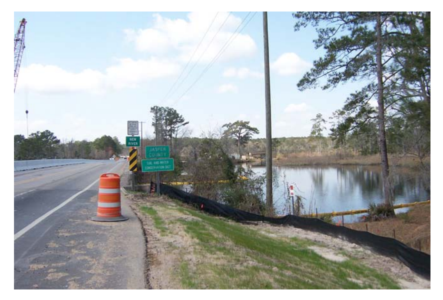
Continue river cleanup of the New River and other watersheds