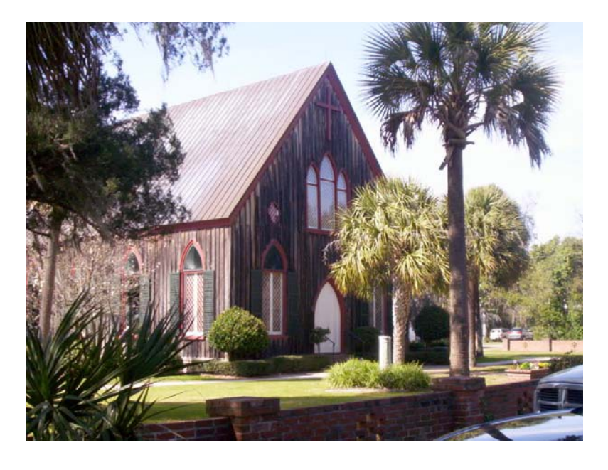
Two historic churches