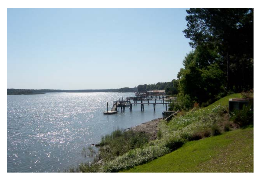
Continue river cleanup and protection of the May River