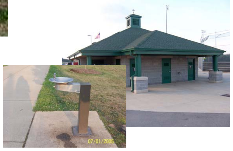
Restrooms and drinking fountains are suggested along the route.