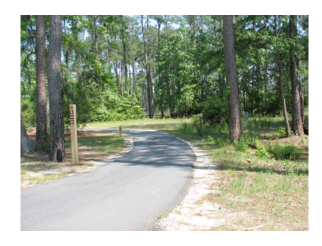
Pathways do not have to be located right beside the road itself.