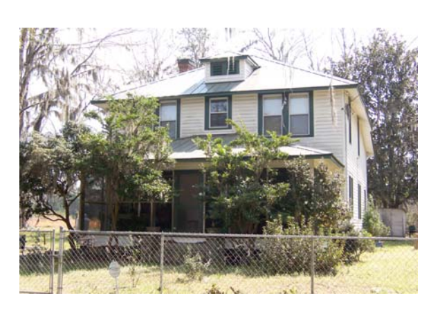
A few of the homes