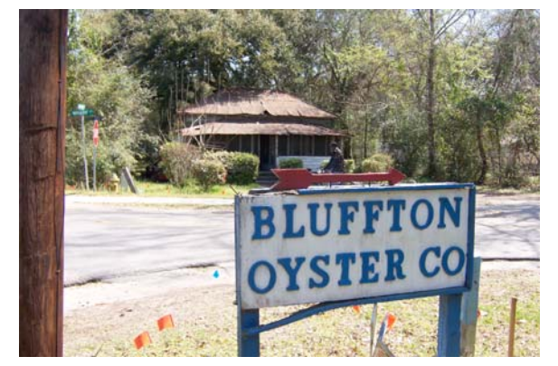
Cultural / Archaeological