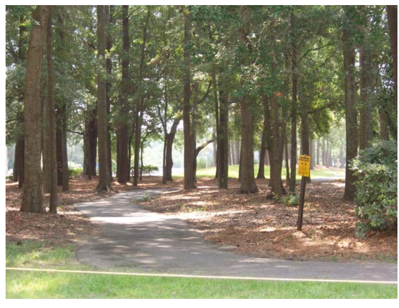
Develop a bike/pedestrian pathway along SC 46 from the Jasper county line into the Town of Bluffton.