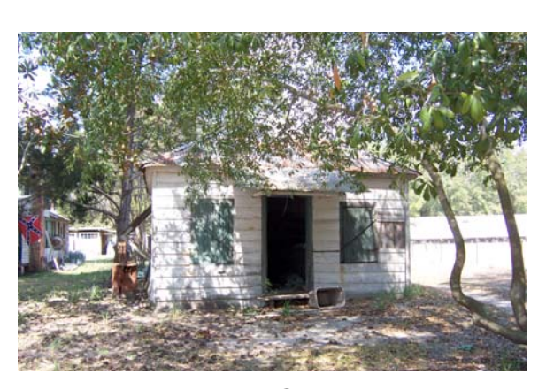
The Post Office