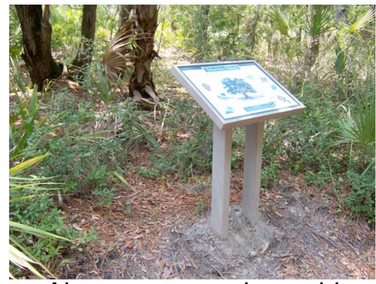
Also recommend wayside exhibits at these sites

Three suggested designated "photo ops" include the overlooks at Stoney Creek, Rose Dhu Creek and the linear rails-to-trail site.