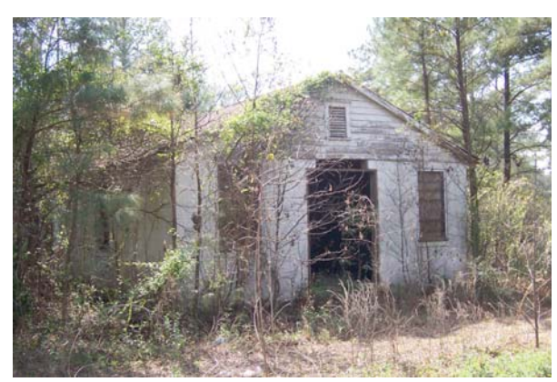
A Praise House or Church