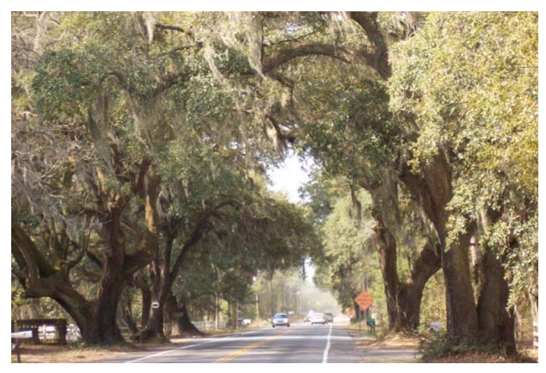
Tunnel effect near Tabby's Place