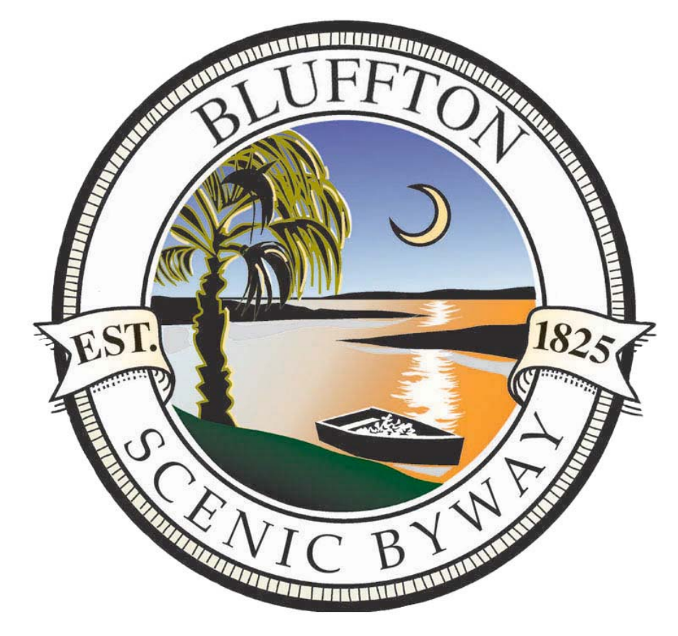
Corridor Management Plan for SC 46