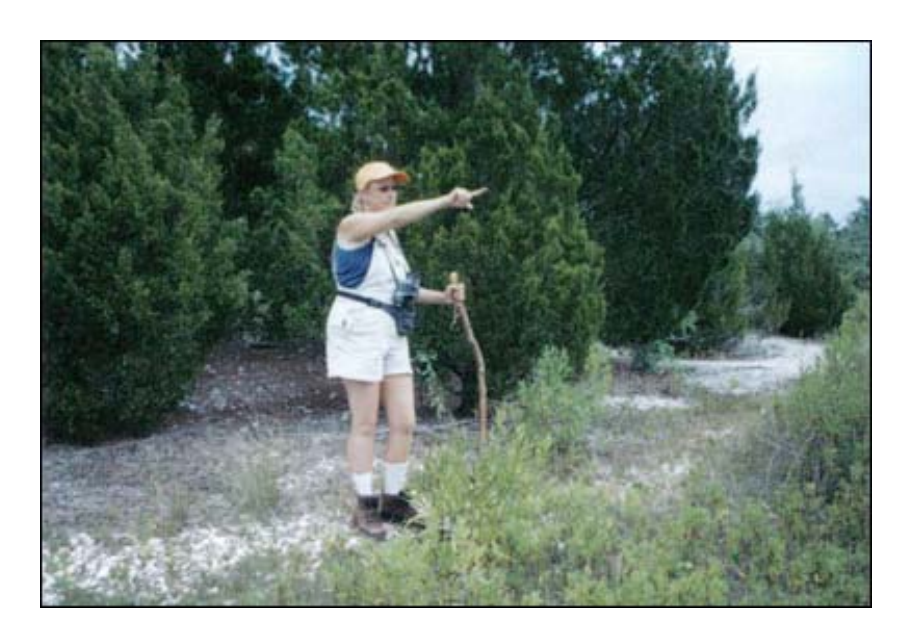
Nature and water-based activities

Emphasize an economic base that focuses on resource conservation and clean industry such as outdoor recreation and tourism.