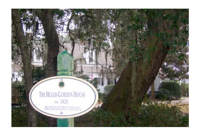
Signage for historic walking tour