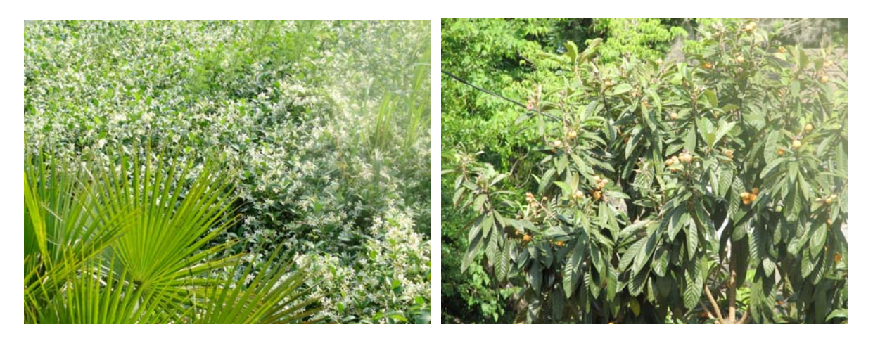
SC 46 Corridor Management Plan for Bluffton Scenic Byway 82