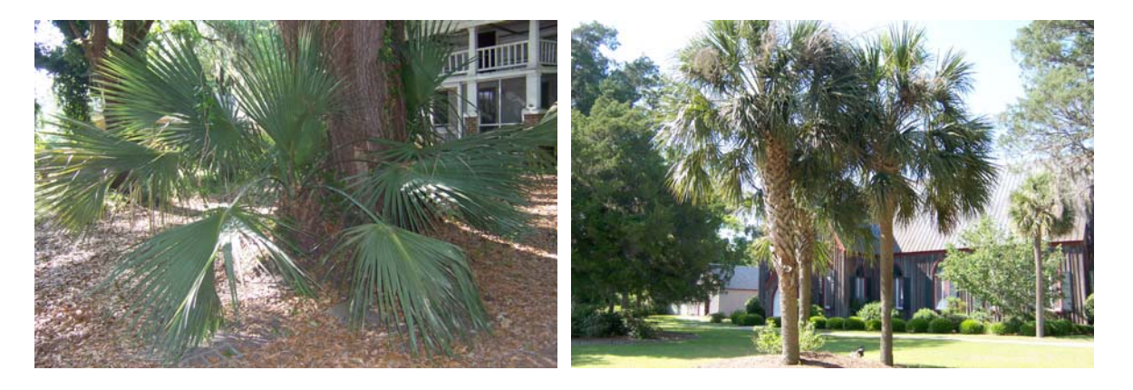
Samples of the variety of plant life along the proposed route of Bluffton Scenic Byway

Ligustrum sinense Ligustrum lucidum Elaeagnus pungens Phyllostachys aurea Thelypteris dentata Hedera helix Commelinaceae (White-flowered Wandering Jew) Alternanthera philoxeroides Broussonetia papyrifera Lonicera japonica Melia azederach Nandina domestica Firmiana simplex Wisteria sinense Morus alba