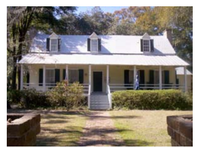
The Heyward House

This historic home located on Boundary Street was one of the few structures still standing within the community after the Civil War. Known as the Heyward House, it currently serves as a House Museum and Bluffton's Official Welcome Center.