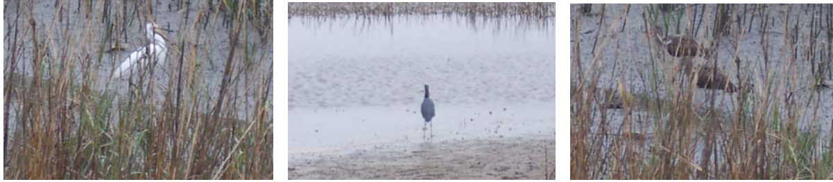
Bird, Butterfly, Flora and Wildlife Viewing