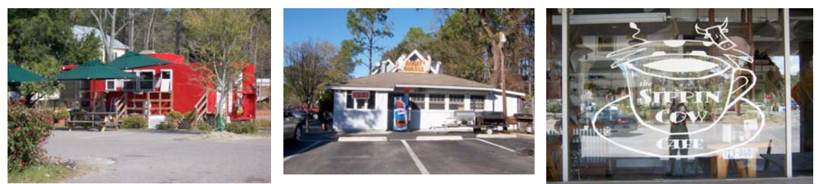
Unique Dining Experiences throughout the community