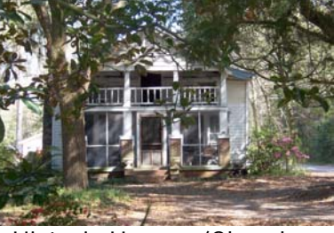
Historic Homes /Churches

At the eastern end of the Scenic Byway lies the original one square mile of Bluffton referred to as Old Town. There is a small area within the core of Old town containing the most historic properties along the May River and north of Calhoun Street that has been designated a National Historic District. In an effort to protect the historic integrity of this District, the Town of Bluffton created a Historic Preservation Overlay District encompassing the National District.