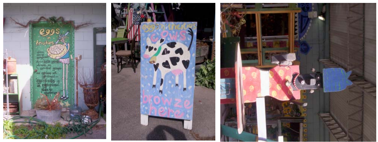
"Eggs'n tricities" is just one of the local businesses with a fun, quirky sense of humor

For example, each year they have a parade. The "drill" team happens to be the women in town parading down the road with Black & Decker drills in hand. Everything about the town gives you the feeling that the residents don't mind poking a bit of fun at both themselves and the visitors who come through. It has the charm of a small historic community mixed with a wonderful sense of humor.