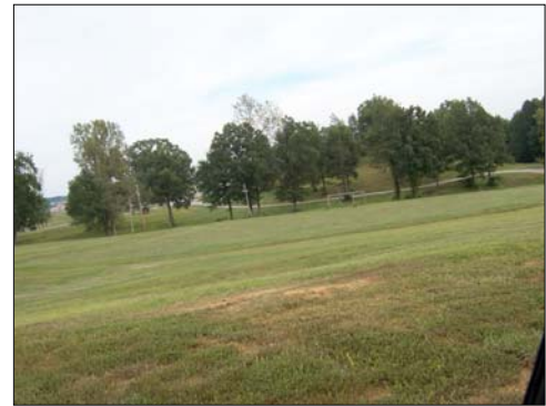
Location for hole # 5