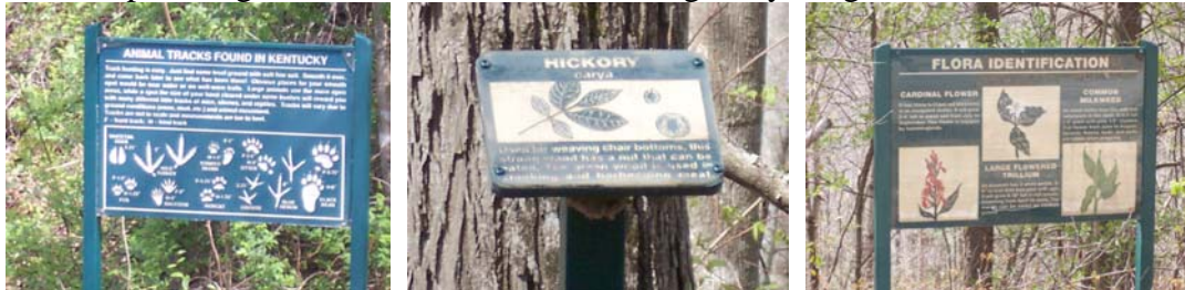
There are over 20 wayside exhibits and interpretive signs at Fish Pond Lake in Letcher County. Every community should have similar signs installed throughout their county.