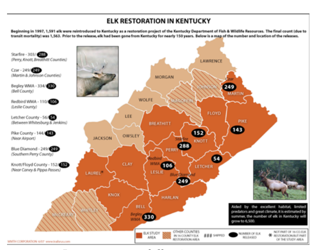
Larger map on following page

Today, through proper management, southeastern Kentucky is home to about 6,500 free-ranging elk, the largest herd east of the Rocky Mountains. The goal is to reach a herd size of about 10,000 animals and maintain that population within the 16-county elk restoration zone.