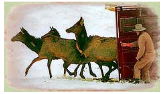
Elk being released in LBL in 1996

The elk at LBL originally came from Elk Island National Park in Alberta, Canada in 1996 when 29 elk were released into the Elk & Bison Prairie Demonstration Area. The herd has continued to grow to 74 today.