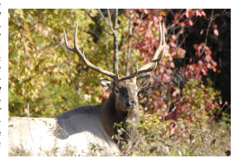
Elk among the fall foliage... Two breathtaking sights one will find in Eastern Kentucky.

administrative outreach. As the ECWI progresses and matures, we will need to expand our personnel capacity to implement an effective land protection program that will benefit from enhanced public funding sources. Should healthy levels funding become established, RMEF may need to add a Lands Program Manager (LPM) in support of the Appalachian Wildlife Initiative."