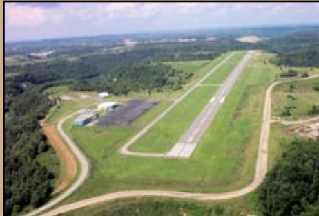
Big Sandy Regional Airport, Martin County