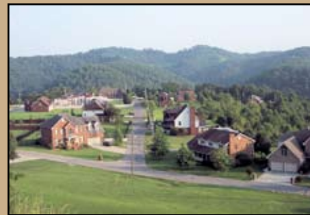
Subdivision, Hazard, Kentucky

The trails created from removing coal and timber from these areas are ideal for ATV, horseback riding, mountain biking and other recreational activities