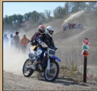
Hare Scramble, Knott County

The trails created from removing coal and timber from these areas are ideal for ATV, horseback riding, mountain biking and other recreational activities