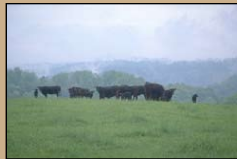
Cattle Farm in Chavies, Perry County