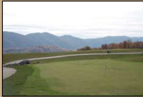
Raven Rock Golf Course, Letcher County

All surface-mined land today is reclaimed equal to or better than it was prior to mining and has provided land for airports, golf courses, shopping malls, ball fields, vineyards, subdivisions, hospitals and more! These areas of level land are helping to create a sustainable and more diverse economy in a part of the state that desperately needs it.