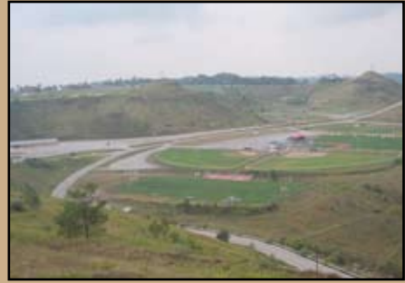
Recreational Area, Floyd County