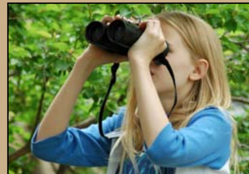
Birding & Wildlife Viewing, Eastern Kentucky