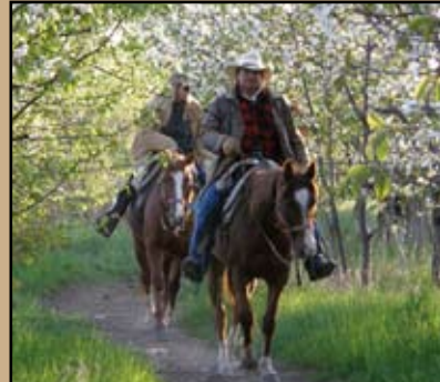
Horseback Trail Riding, Eastern Kentucky