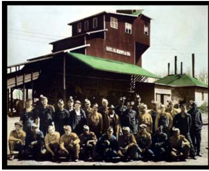
1910 -1954 Active Mining Taking place at George H. Rudy Mine 2003 – Rudy Mine and Farm becomes a part of the Kentucky State Park System