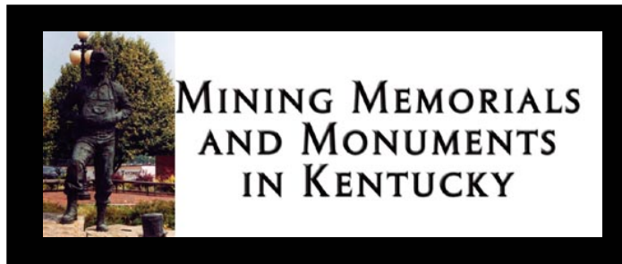
This monument in Providence KY serves as a tribute to Coal Miners. It will be one of many stops included on the Coal Legacy Trail in Western Kentucky