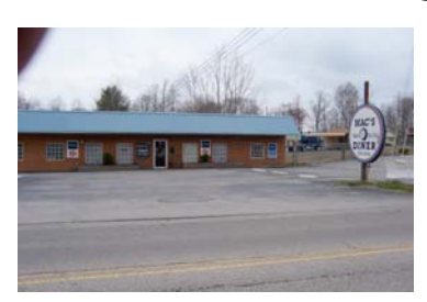
Mac's Diner (1.6) #18a