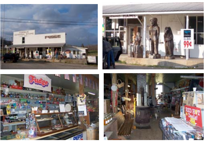
Forbus General Store (18.3) #1