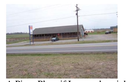
A Pizza Place if I remember right