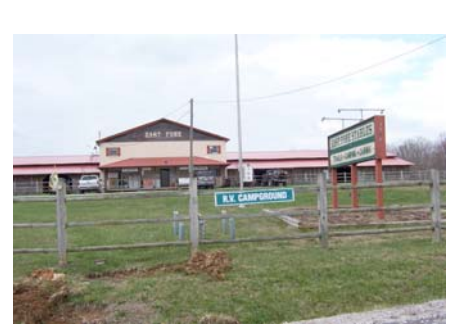
East Fork Stables (6.6) #30 (Camping, gift shop, cabins, horses, 12,000 acres)