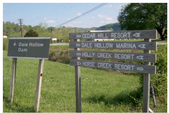
Sign for Dale Hollow Lake and Resorts