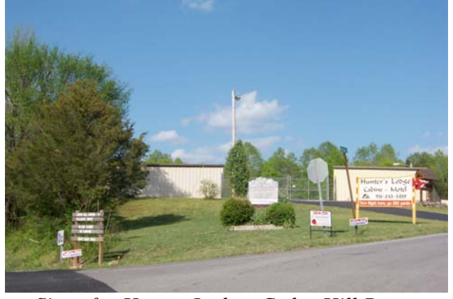
Signs for Hunter Lodge, Cedar Hill Resort and "Boat Motel"