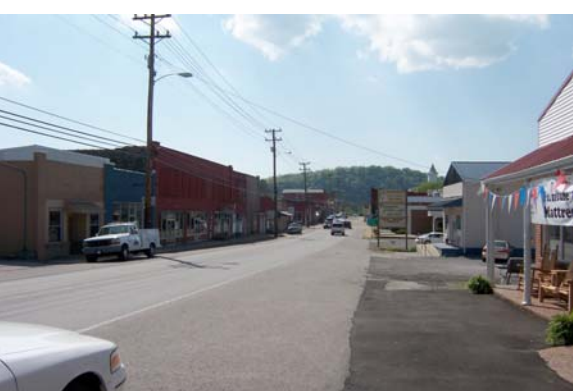
Dutch Crafts and Furniture