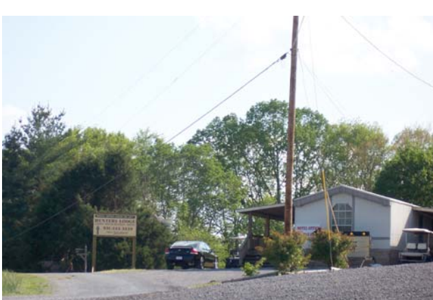
Holiday Hill Motel Office and sign to Hunter's Lodge