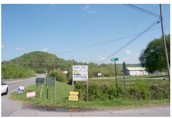
Signs on Hwy 53 at River Road directing people to Dale Hollow Lake area and campground