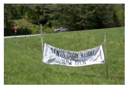
Sign for Beni's Cuban Restaurant