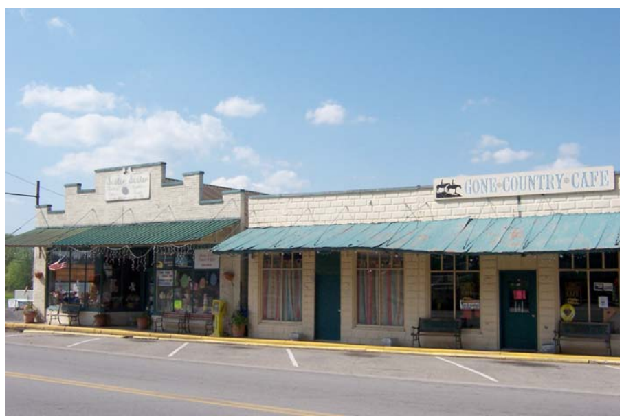
Sister Sister Antique Shop/Crafts Gone Country Café

_______From Downtown CELINA west on Lake Avenue ______