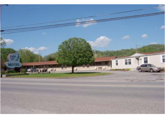
Valley View Motel