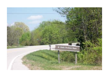
Sign for Dale Hollow Dam