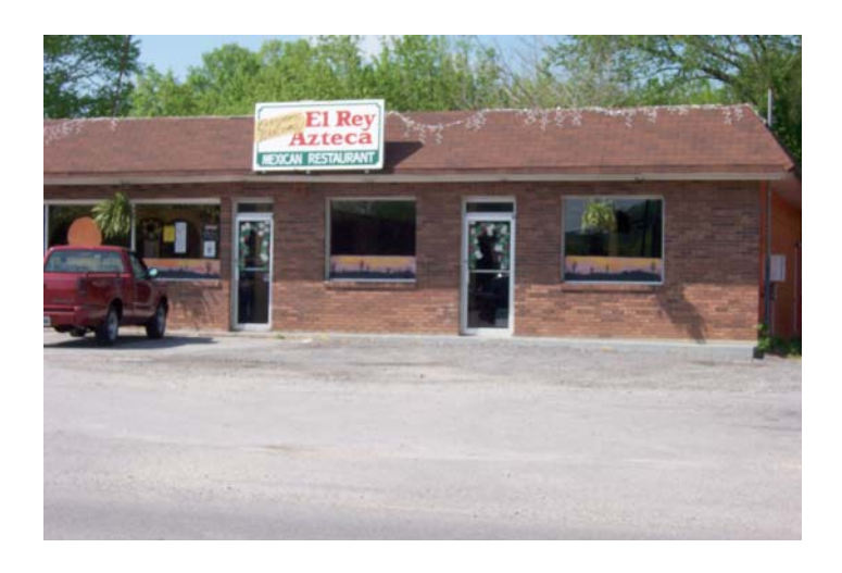
El Rey Mexican Restaurant Car Wash

Fitzgerald Cemetery (Parents of Cordell Hull buried here)