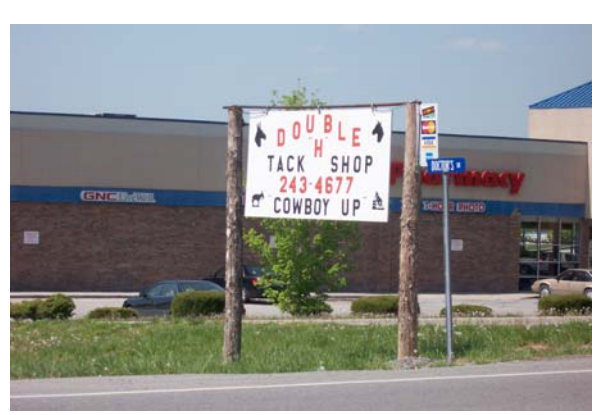
Sign for Tack Shop in front of Rite Aid Pharmacy