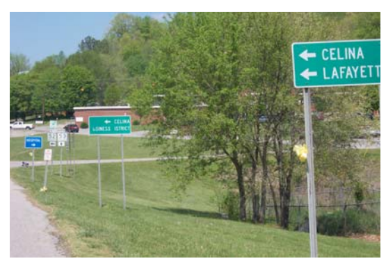
TURN EAST ONTO HWY 53 (which HWY 52 joins for two miles) Or turn south on Hwy 52 which takes you to Livingston