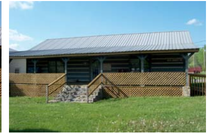
Clay County Museum

____Turning onto Hwy 52 heading into Downtown CELINA_____