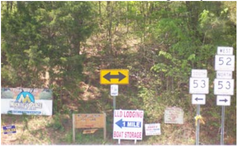
Lots of signs at T