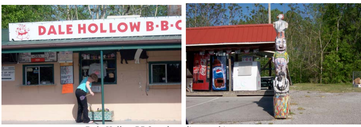
Dale Hollow BBQ and vending machine area