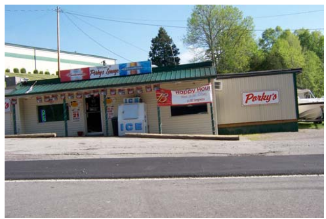
Porky's Lounge is right before the sign for Cedar Hill Resort (noted below)