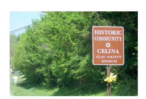
Sign for Celina Museum