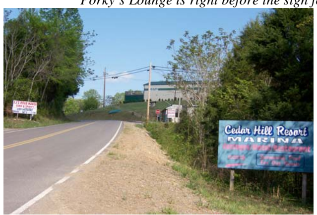
Signs for Cedar Hill Resort and JJ' Roadhouse & Spirits