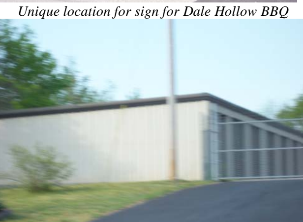
"Boat Motel" Storage facility