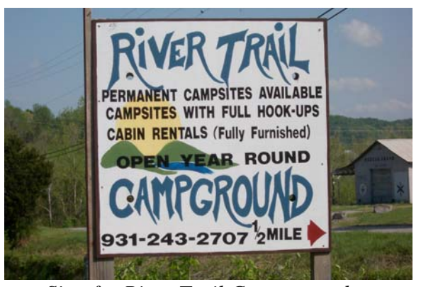
Sign for River Trail Campground