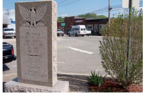
Clay County Courthouse