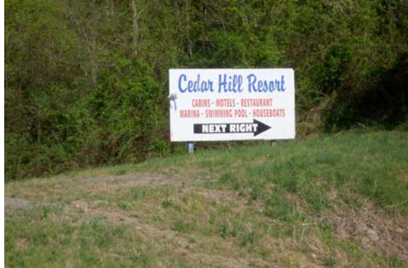
Signage directing people to Dale Hollow Dam and Cedar Hill Resort