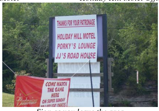
Sign as you leave the area

____From Downtown CELINA – East to Hwy 52 towards Hwy 53____