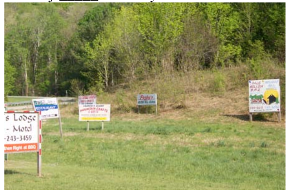
Turning right onto _____