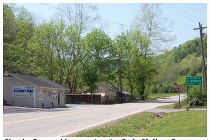
Shanky Bar and brown sign for Dale Hollow Dam Sign for Nashville, Gainesboro (west) Celina (east)