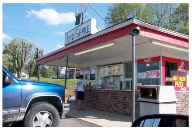
Porky Shake Restaurant (Town of MOSS)