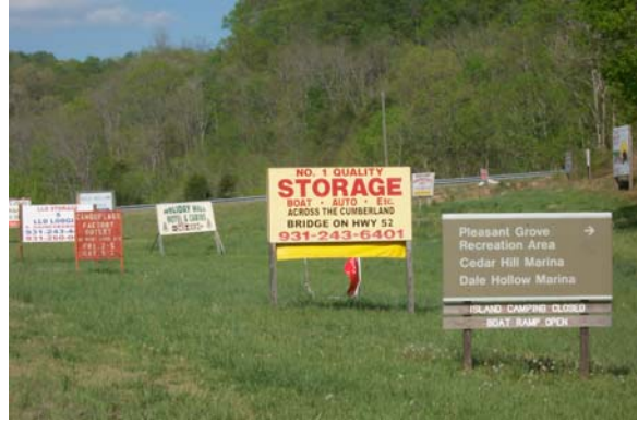
Proliferation of signs at the corner of ____ and Hwy 53