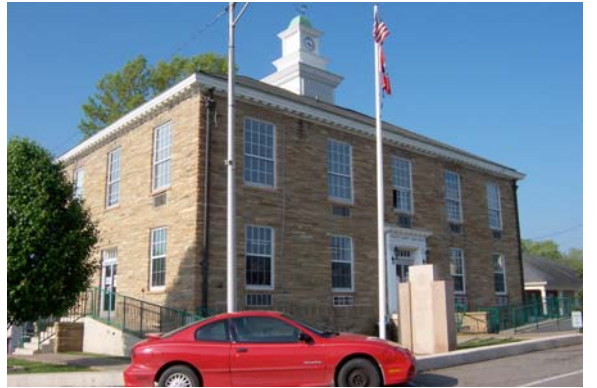
Pickett County Courthouse