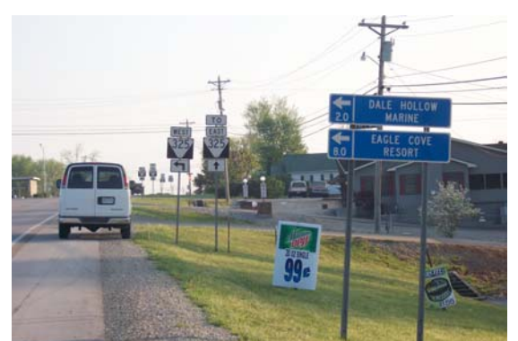
Different signage directing visitors to turn to get to both Dale Hollow Marine and Eagle Cove Resort which includes mileage.