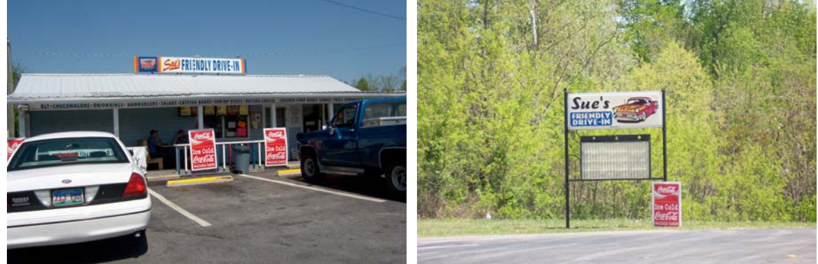
Sue's Drive-In also on Hwy 111