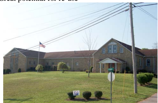
First Baptist Church at corner of Maple and Main