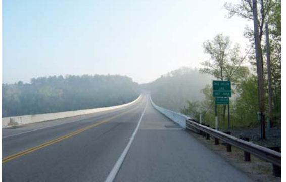
Bridge across the Obey River at Dale Hollow