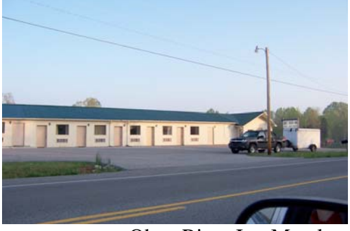
Obey River Inn Motel