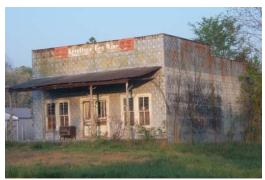
Keisling's General Merchandise Store