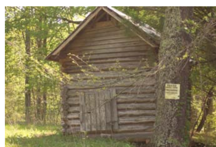
One of the buildings that will be moved to the site and interpreted.

This structure, located at the proposed site for the Visitor Center will be renovated at included as part of the living history museum. It is very visible from Hwy 111 and strategically located just before the turn off to Historic Byrdstown.