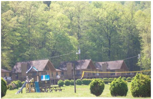
The marina at Eagle Cove offers "Big Foot" Houseboats are for rent.

Two brown signs on Hwy 325 directing travels which way to turn to head towards Star Point Marina and Eagle Cove Marina.