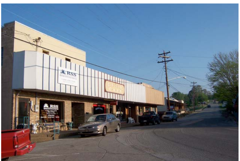
Dixie Café in historic Downtown Byrdstown

The Bobcat Den Family Restaurant (need photo) is also located on Hwy 111 near the intersection of Hwy 325. This restaurant only accepts cash*.