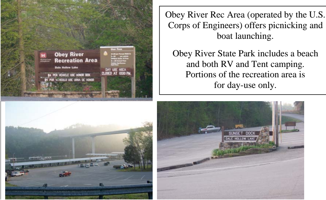
Sunset Dock, Marina and Restaurant is located right on the water. Great facility, easily accessible off Hwy 111 with ample parking. ( Note: Road above is Hwy 111 )