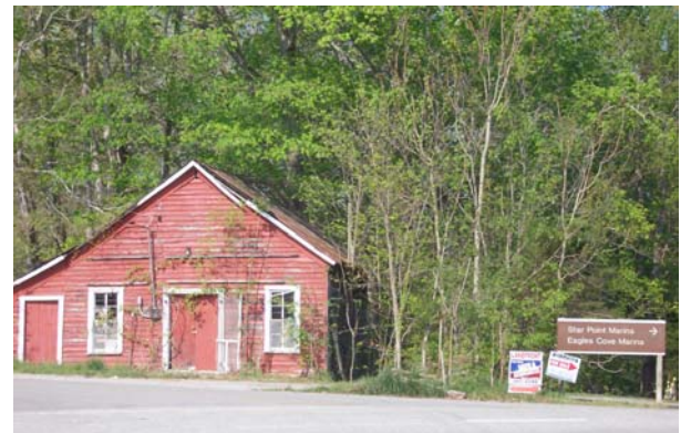
Confirmation signage letting the traveler know they are heading the right direction to Star Point and Eagle Cove Marinas.