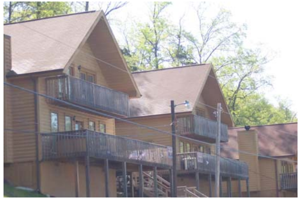
A few of the chalets available to rent at Eagle Cove on Dale Hollow Lake.

Eagle Cove Resort just off Hwy 325 on Dale Hollow Lake offers houseboats, chalets, cabins fully furnished with all the amenities. Even some of the houseboats offer hot tubs.