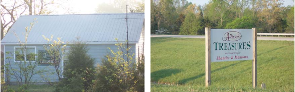
Alice's Treasures included art work and crafts from within the region and around the state. Wonderful shop! Very limited parking and structure was small but it had excellent art well displayed in a four room house.

Recently set up a store in a mall in Cookeville to get more exposure for the artisans.