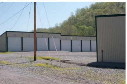
Boat Storage Business