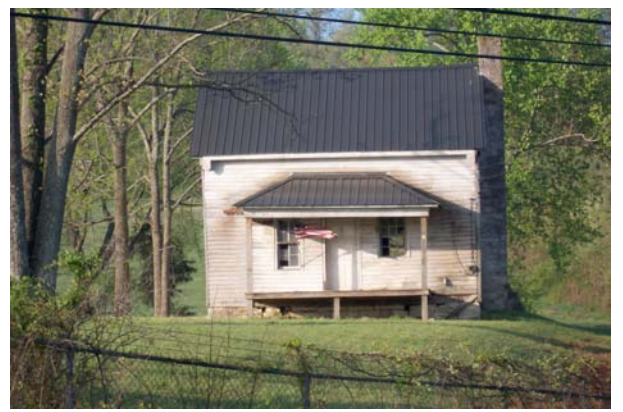
Proposed site for new visitor center/museum

Funding has been received for building a Tourist Information Center and interpretive living history museum featuring numerous log homes and historic structures.