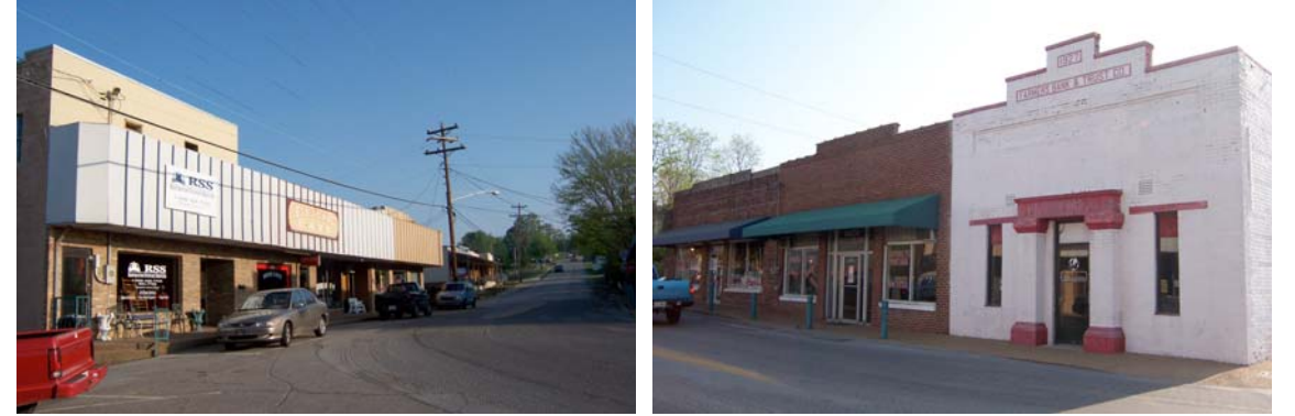
Dixie Café and Respiratory Center

Farmer's Bank c.1927 (Future Home of Ladybug)