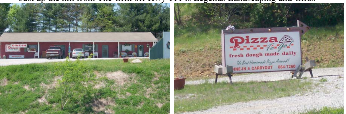
Pizza to Go on Hwy 111