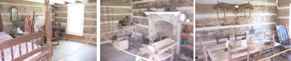
Interior of Cordell Hull's First Homeplace