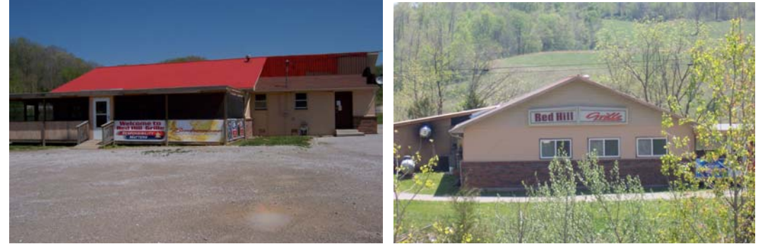
The Red Grille is popular in the evenings and includes food and music (across from Farm House)