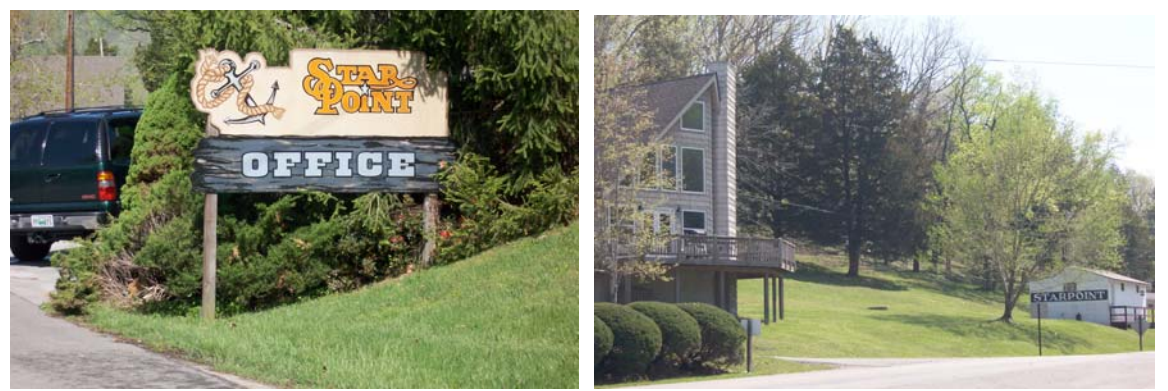
Sign at StarPoint