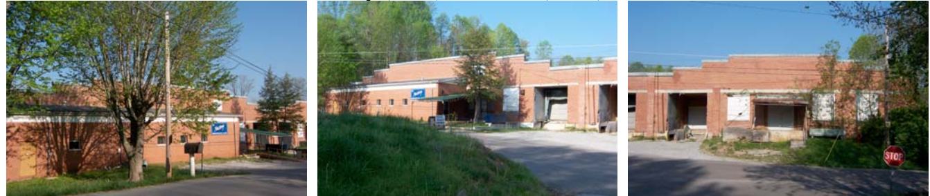
Closed Factory – Great potential for re-use

View from Courthouse of Neal's Grocery (brick) & Market (white)