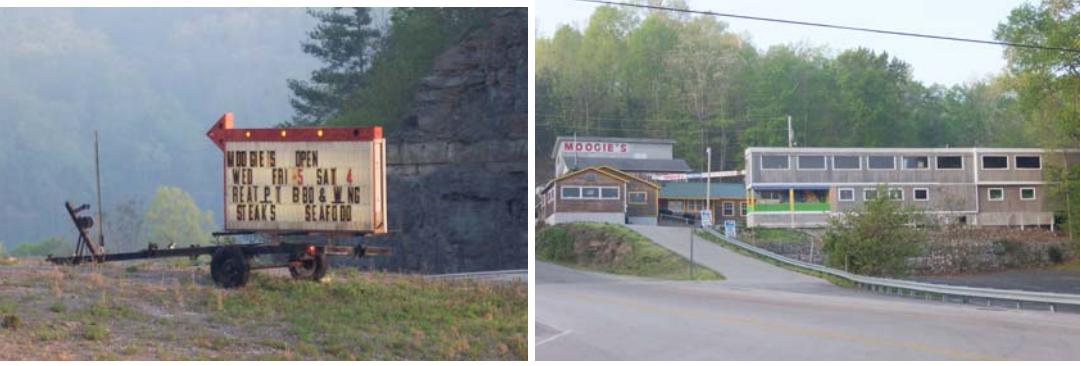
More signage on Hwy 111 to turn off and visit Moogies Restaurant (Open Wed, Fri. Sat) next to Obey River Recreation Area and Sunset Marina.

Signage directing travelers off Hwy 111 to a recreation area that includes two restaurants (Moogies and Sunset), a marina, beach area, and campground, Lodging in this area also includes the "SunCatcher" Lakeview Vacation Rental.