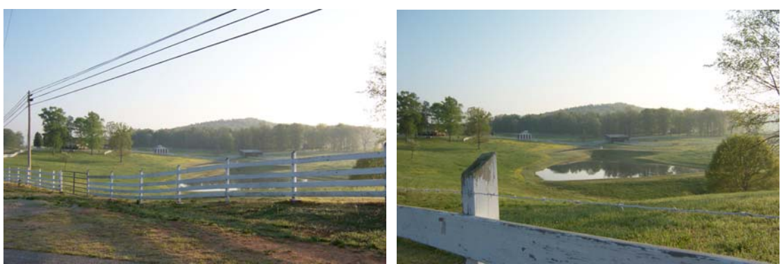
Scenic views of farmland from Hwy 111 near Alice's Treasures