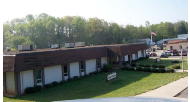
Senior Citizen Center