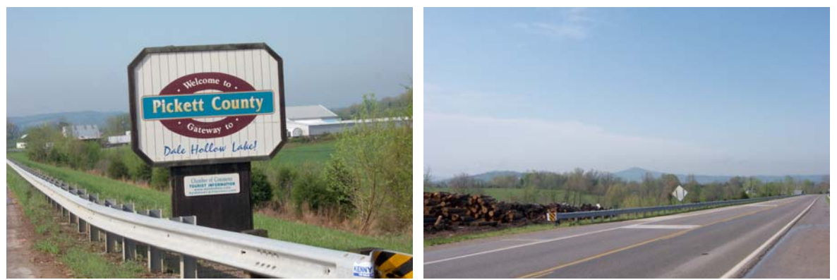
Welcome sign and view as one enters Pickett County from Fentress County

As one nears Byrdstown and Dale Hollow Lake area on Highway 111 heading west, the primary businesses one sees are restaurants.