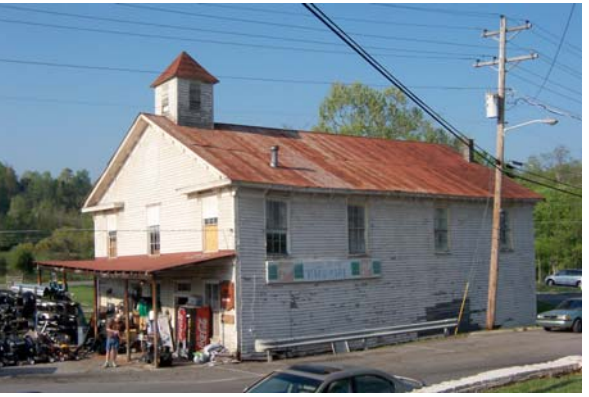
Wonderful historic school house - Potential