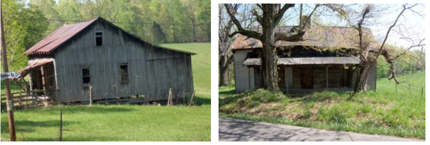
Another building that might be moved to the site and interpreted.