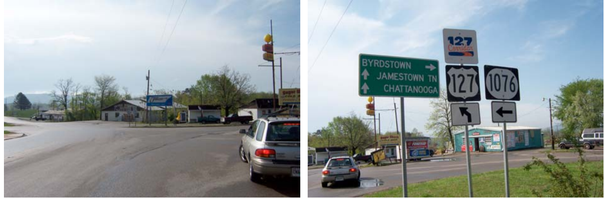
This is the Hwy 127/111/1076 intersection. Turn right (west) into Pickett County