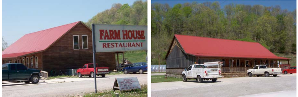
The Farm House Restaurant is just one of seven restaurants within 10 miles (on Hwy 111)