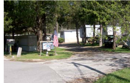
Silver Bell Group Subdivision