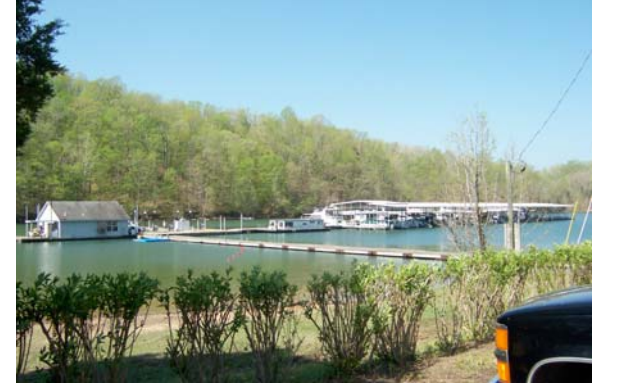
View of marina at StarPoint

StarPoint Resort describes itself as a fishing camp-vacation resort on Dale Hollow.