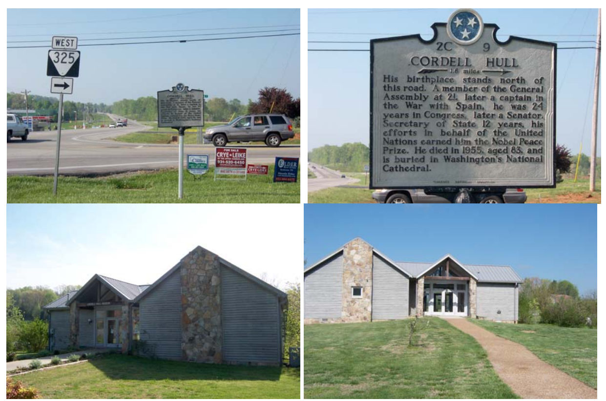
Cordell Hull Visitor Center includes a museum, library and movie