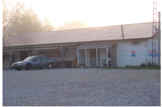
County Line Flea Market and Auction