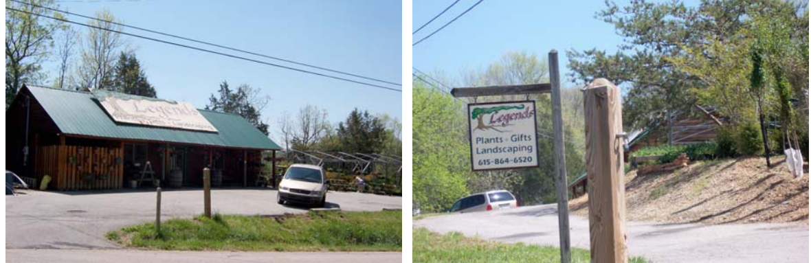
Just up the hill from The Grill off Hwy 111 is Legends Landscaping and Gifts.