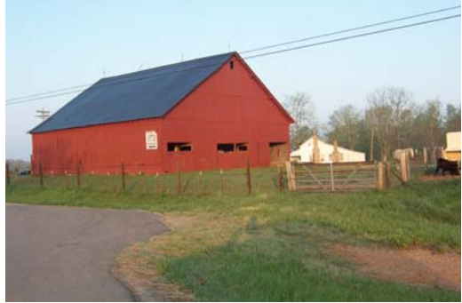
Barn with sign directing people to County Line Bait Shop