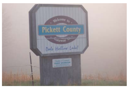
Welcome Sign as one enters County