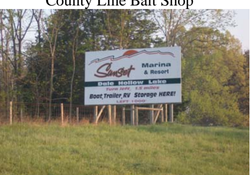
Billboard directing people to Sunset Marina and Resort on Dale Hollow Lake