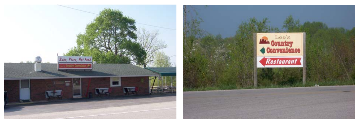
Restaurant and signage for it on Hwy 325