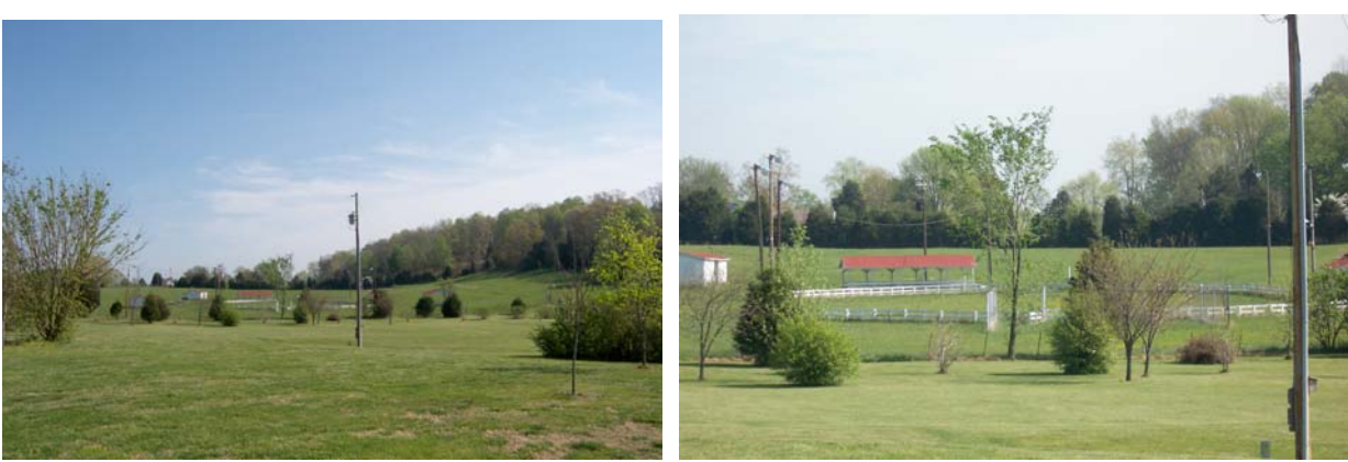
Lighted Equestrian Riding Ring behind Visitor Center

Across from Cordell Hull's Birthplace one can see the parking lot to a cave the State Park system is developing. Anticipated to open in Fall 2006. Expected to draw more tourists to the area