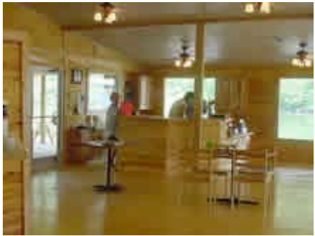
Restaurant at East Port Marina.

Dixie Café, the only restaurant downtown, offers breakfast, lunch and dinner plus live music periodically.