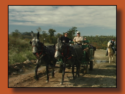
Creek crossings, partially wooded, partially open fields and beautiful streams.

4 hour ride (12 to 14 miles) Great trail for both wagons and horse riders.