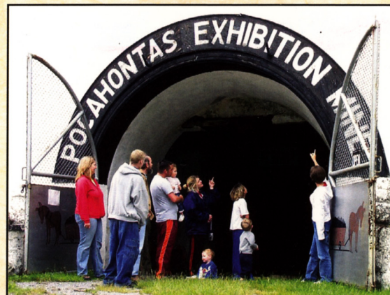
Pocahontas Exhibition Mine

Pocahontas was the first and largest coal-mining town in the Virginia Coalfields. The famous 12-foot vein was one of the largest and best quality veins in the nation. Although the seam has all but been exhausted in the Town of Pocahontas, the stratum is still considered to be the princess of the coal country in Virginia. Since the closing of the mine in 1955, many of the historical buildings erected during the height of the coal mining industry have remained, maintaining the feel of a coal mining town from the turn of the last century.