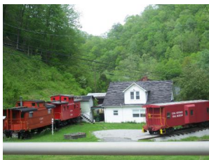
Red Caboose B&B and Coal Museum near Haysi

The visitor center in Big Stone Gap was once a private rail car used by the president of the railroad and is one of the oldest and finest examples of typical passenger car construction of the late 19 th century. Built in 1870 for the South Carolina & Georgia Railroad, it contains an observation room, two staterooms, a dining area and facilities for the porter and a kitchen area. Most of the original fixtures are intact, including the lavatories, lighting fixtures, and even the speedometer in the rear observation room.