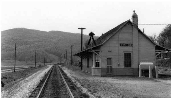
1950 photo of the Duffield Depot

The Duffield Depot is currently being used as a storage shed. Efforts should be made immediately to obtain the depot and move it to the site next to the depot used in the "Coal Miner's Daughter" movie on display at the corner of Hwy 58 and 23 in Scott County. The building could then be used to house and display Kenny Fannon's tremendous collection of train memorabilia.