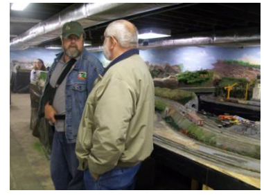
More photos of the model railroad area which fills two rooms.