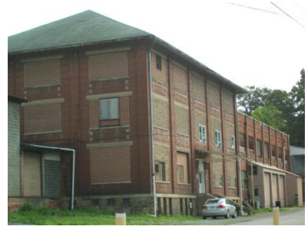
Freight Depot in Appalachia

Once there were railroad depots in nearly every community along the Virginia Coal Heritage 325 mile route. Now there are only six. Appalachia is unique in the fact that it still has both its passenger and its freight depots. The freight depot is easily accessible and in excellent shape.