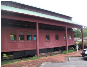
Visitor Center in Big Stone Gap

The visitor center in Big Stone Gap was once a private rail car used by the president of the railroad and is one of the oldest and finest examples of typical passenger car construction of the late 19 th century. Built in 1870 for the South Carolina & Georgia Railroad, it contains an observation room, two staterooms, a dining area and facilities for the porter and a kitchen area. Most of the original fixtures are intact, including the lavatories, lighting fixtures, and even the speedometer in the rear observation room.