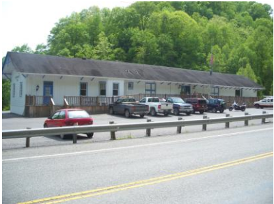
Fremont Depot – Offices