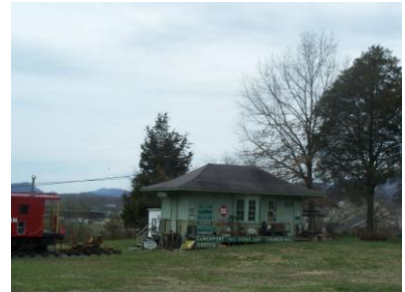
A railroad museum in Duffield is in a depot from a movie set

But where there were once a depot in nearly every community, there are now only six along the 325 mile route, four of which are noted above. The others are at risk of being lost forever. They include the Duffield Depot which has actually been moved from its original location and is being used as a storage shed in an area outside the region, the depot at Dante which is scheduled for demolition and the Appalachia passenger depot which is currently landlocked and in need of repair. Actually the town of Appalachia has two depots. One was for passengers and the other was used for freight. These four depots are featured on the following page. For more on this, see “Sites at Risk” later in this chapter.