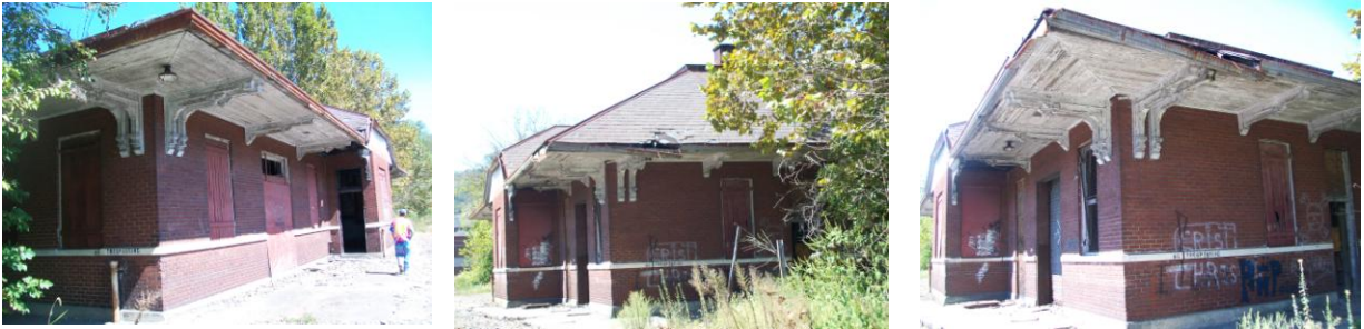
Three views of the passenger depot in Appalachia VA.

What the passenger depot does have going for it is that it is very viewable from more than one location.