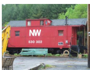
Caboose on display in Pocahontas