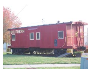
Future Information Center in Pennington Gap