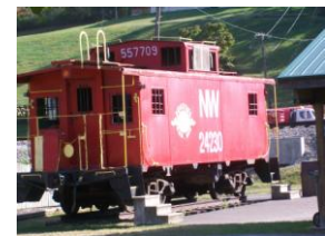
Caboose in Coeburn

The NW Caboose to the left is scheduled to be refurbished soon and moved to a vacant lot near the Bee Rock Tunnel between Appalachia and Big Stone Gap where it will become a visitor information center for the trail system being developed.