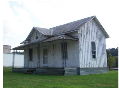
Railroad Section House in Richlands