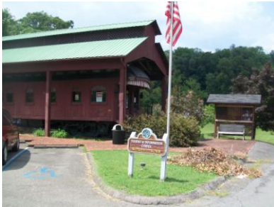
Railcar in Big Stone Gap serves as their visitor center