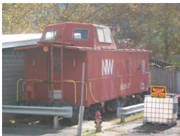
This caboose is currently located in downtown Appalachia.

The NW Caboose to the left is scheduled to be refurbished soon and moved to a vacant lot near the Bee Rock Tunnel between Appalachia and Big Stone Gap where it will become a visitor information center for the trail system being developed.