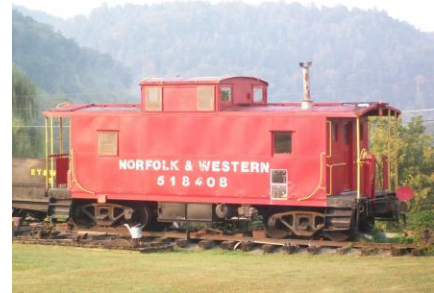
Caboose at Duffield

Rail cars are also being used for other purposes along the trail which have helped to preserve them for future generation. The Coal Heritage Trail Train museum just outside of the town of Haysi is housed in an old rail car. And two cabooses next door are used for lodging for the Red Caboose Bed & Breakfast. The Railroad Museum in Duffield houses some of its railroad memorabilia in Norfolk & Western caboose. There is also a rail car featured at the park in Coeburn and Pennington Gap has plans to convert their Southern caboose into an interpretive visitor information center for the Virginia Coal Heritage Trail.