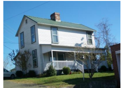
Railroad Section Manager's Home