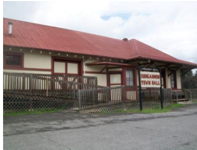
Dungannon Town Hall