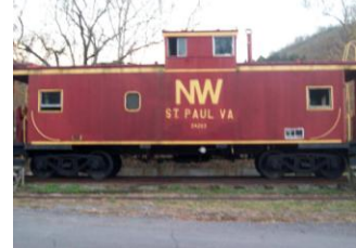
Caboose on display in St. Paul