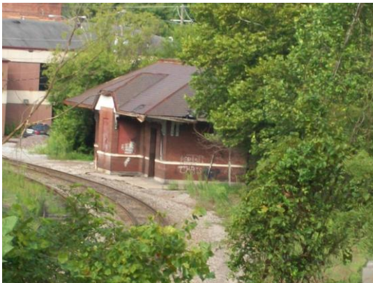
View from freight depot

To the left is the view from above from the turnoff to the freight depot. A great place to pull over and view the passenger depot.