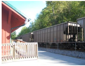
Live tracks next to the depot

One example of a converted depot being used by the community for offices and meeting space yet is located next to a live track is the Coeburn depot. They had a fence erected that separate the tracks from the structure.