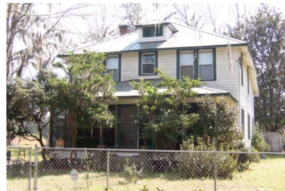
A few of the homes