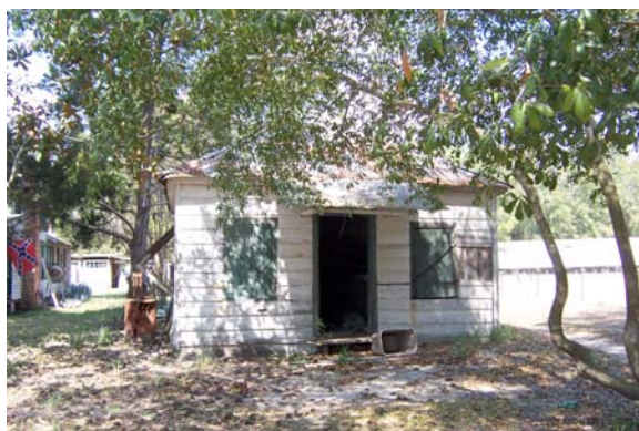
The Post Office