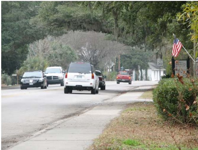
Canopy within Old Town

Goal 1: Conserve and enhance the natural and scenic resources that make this area such an important place to protect and privilege to visit.