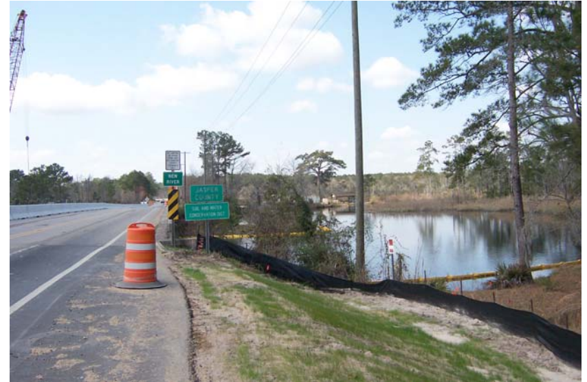
Continue river cleanup of the New River and other watersheds