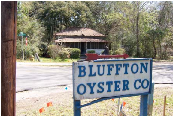
Cultural / Archaeological