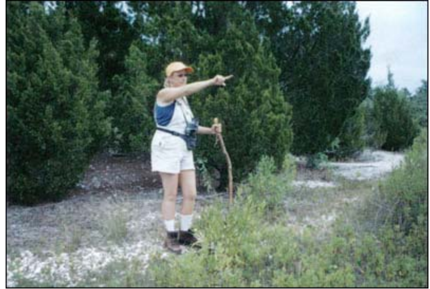
Nature and water-based activities

Emphasize an economic base that focuses on resource conservation and clean industry such as outdoor recreation and tourism.