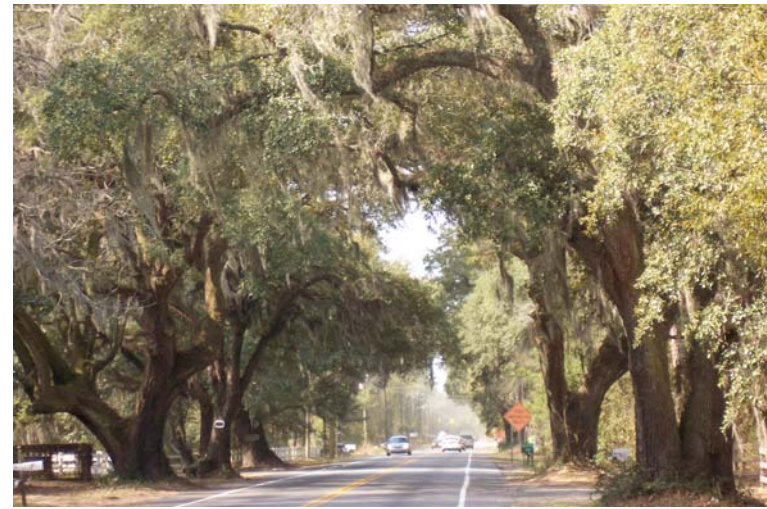
Tunnel effect near Tabby's Place