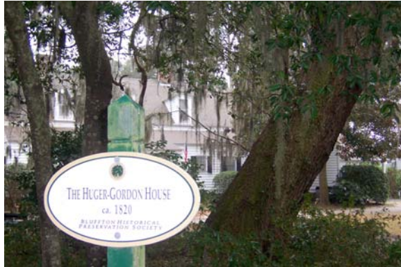
Signage for historic walking tour

Expand the historic walking tour to include a historic driving tour along SC 46