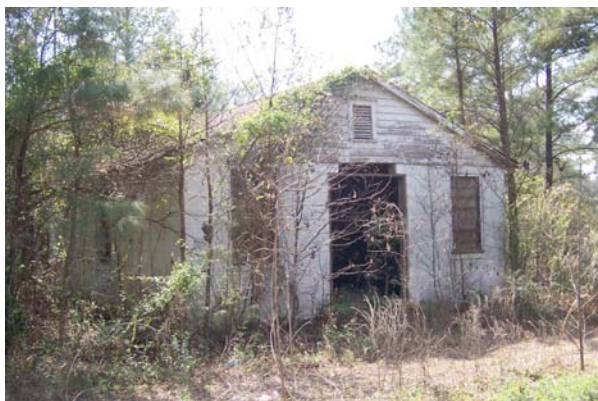
A Praise House or Church