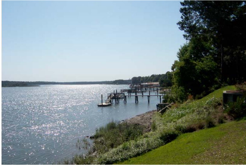
Continue river cleanup and protection of the May River