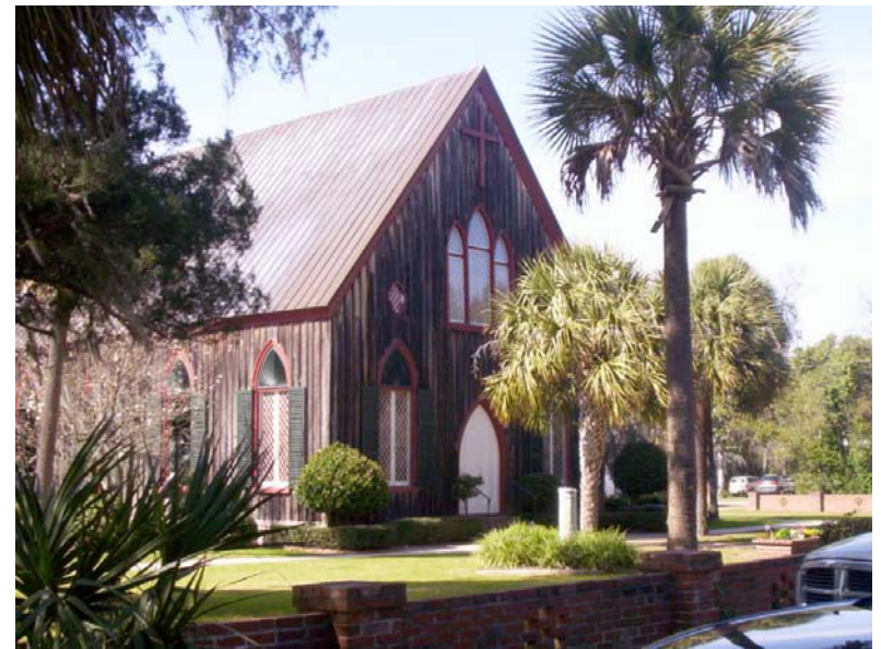
Two historic churches