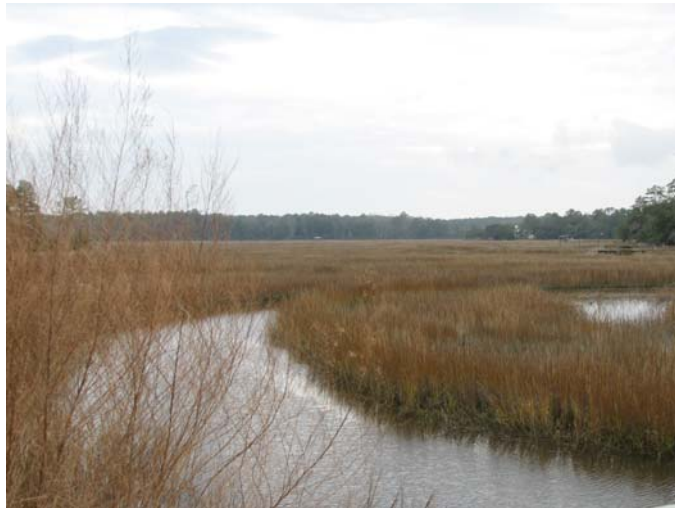
One of the tributaries at Stoney Creek

Protect all water sources and encourage practices that improve water quality and water access.