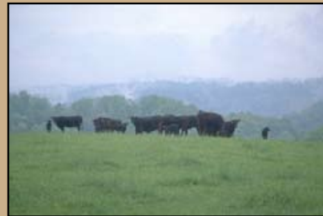
Cattle Farm in Chavies, Perry County