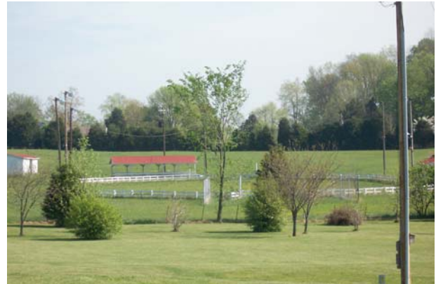
Lighted Equestrian Riding Ring behind Visitor Center