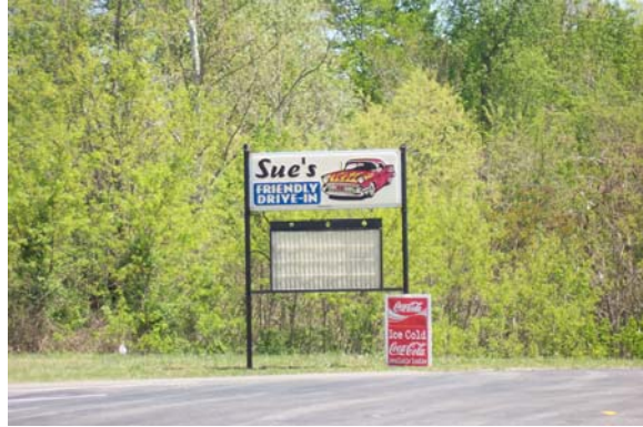
Sue's Drive-In also on Hwy 111