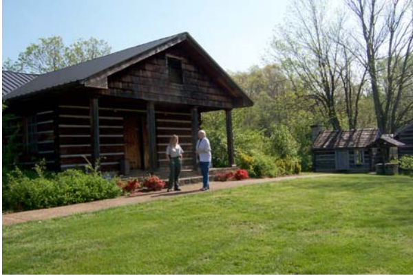
Cordell Hull Offices and meeting area