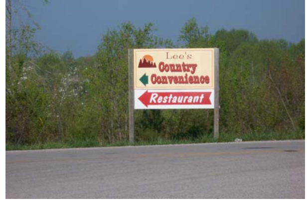
Restaurant and signage for it on Hwy 325