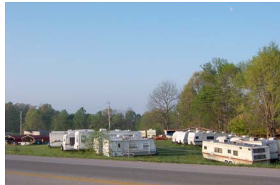
RV Park right off Hwy 111 overlooking Dale Hollow Lake