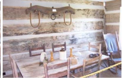
Interior of Cordell Hull's First Homeplace