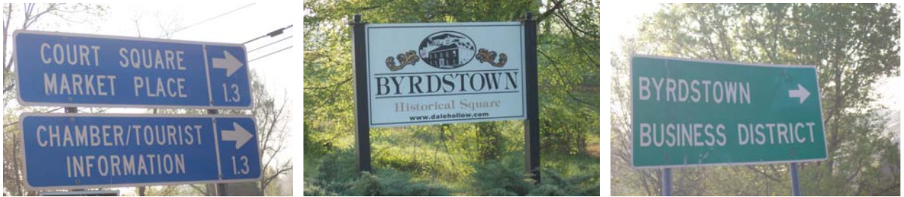
Signage directing visitors off Hwy 111 and into Historic Byrdstown