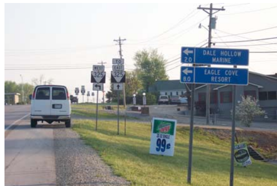
Different signage directing visitors to turn to get to both Dale Hollow Marine and Eagle Cove Resort which includes mileage.