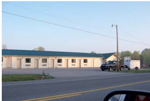
Obey River Inn Motel