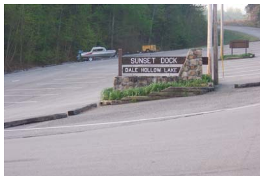
Sunset Dock, Marina and Restaurant is located right on the water. Great facility, easily accessible off Hwy 111 with ample parking. (Note: Road above is Hwy 111)