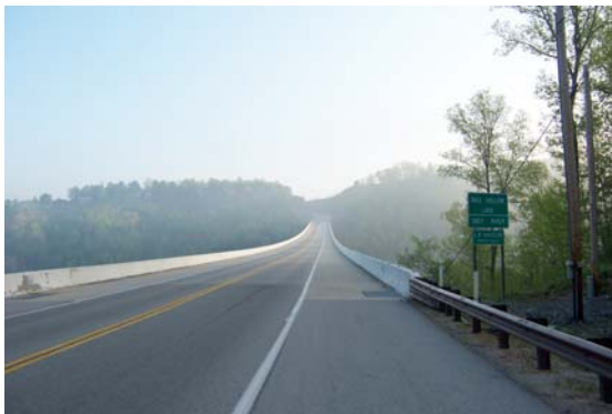
Bridge across the Obey River at Dale Hollow