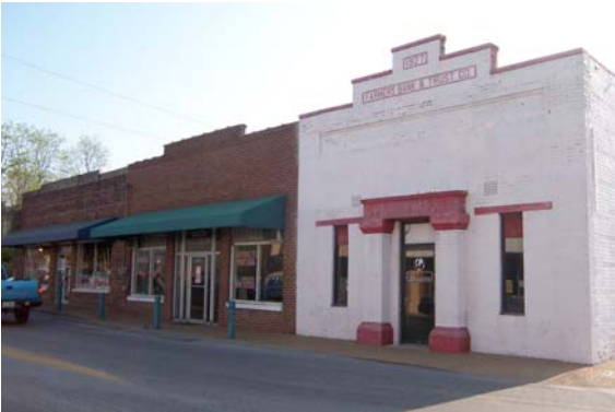
Farmer's Bank c.1927 (Future Home of Ladybug)