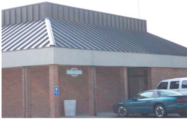
Chamber of Commerce just before one comes to Downtown Byrdstown.