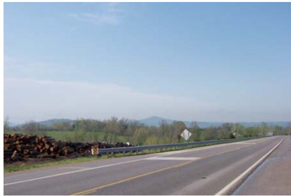
Welcome sign and view as one enters Pickett County from Fentress County

As one nears Byrdstown and Dale Hollow Lake area on Highway 111 heading west, the primary businesses one sees are restaurants.