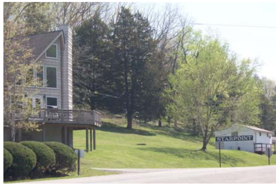
View of lodge at StarPoint