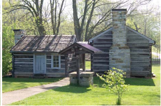
Cordell Hull's Birthplace