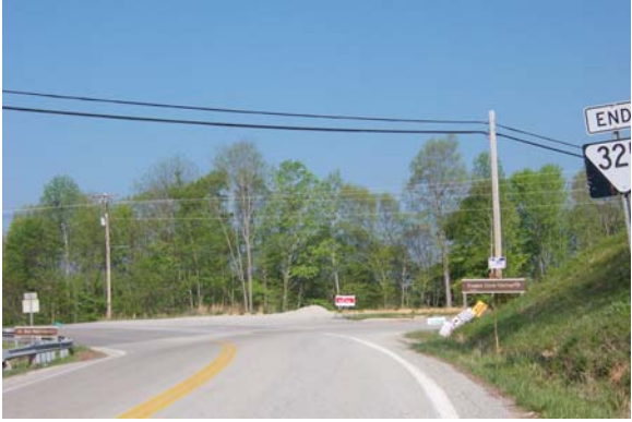
Hwy 325 West leads to Dale Hollow Lake

Two brown signs on Hwy 325 directing travels which way to turn to head towards Star Point Marina and Eagle Cove Marina.