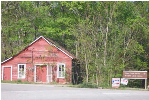
Confirmation signage letting the traveler know they are heading the right direction to Star Point and Eagle Cove Marinas.