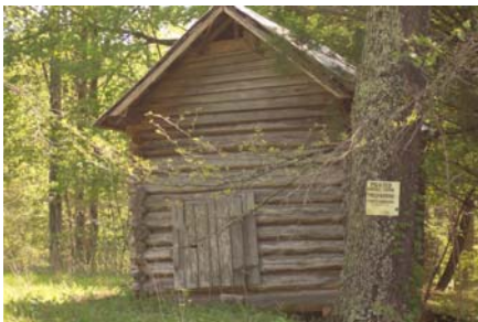
One of the buildings that will be moved to the site and interpreted.

This structure, located at the proposed site for the Visitor Center will be renovated and included as part of the living history museum. It is very visible from Hwy 111 and strategically located just before the turn off to Historic Byrdstown.