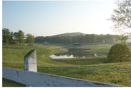
Scenic views of farmland from Hwy 111 near Alice's Treasures