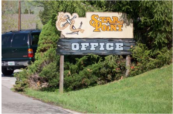
Sign at StarPoint