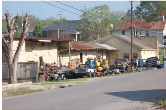
View from Courthouse of Neal's Grocery (brick) & Market (white)