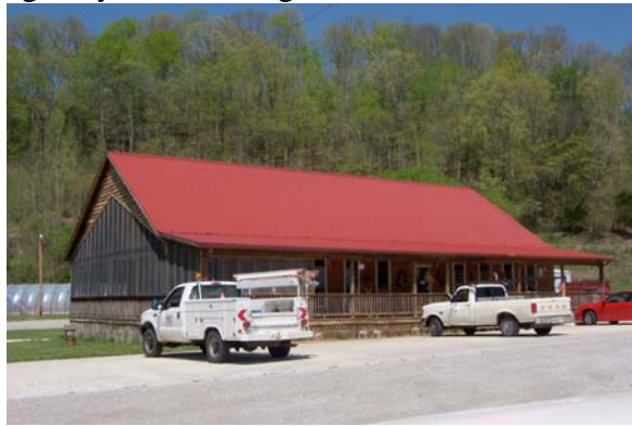
The Farm House Restaurant is just one of seven restaurants within 10 miles ( on Hwy 111 )