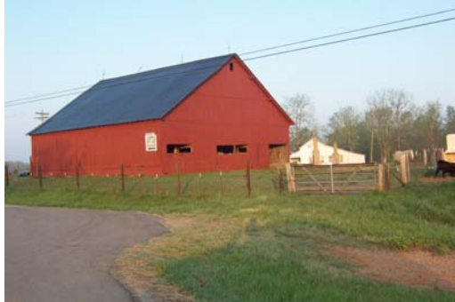
Barn with sign directing people to County Line Bait Shop