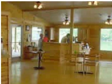
Restaurant at East Port Marina.

There are also restaurants at both East Port Marina and Star Point Marina, a dockside restaurant at Sunset Marina as well as Moogies as noted earlier.