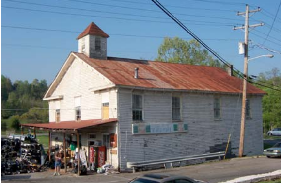
Wonderful historic school house - Potential