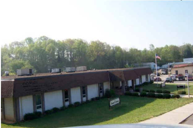
Senior Citizen Center