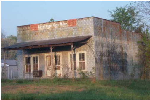
Keisling's General Merchandise Store