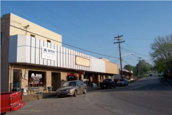
Dixie Café and Respiratory Center