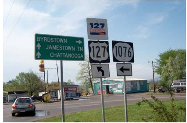
This is the Hwy 127/111/1076 intersection. Turn right (west) into Pickett County