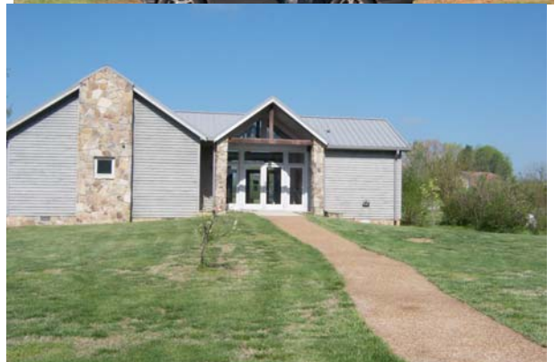
Cordell Hull Visitor Center includes a museum, library and movie