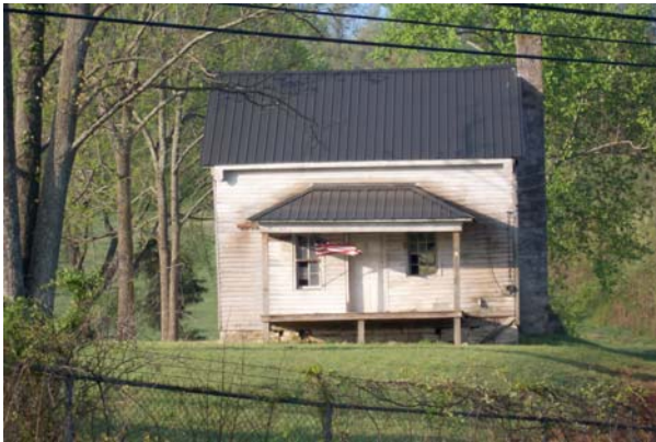
Proposed site for new visitor center/museum

Funding has been received for building a Tourist Information Center and interpretive living history museum featuring numerous log homes and historic structures.