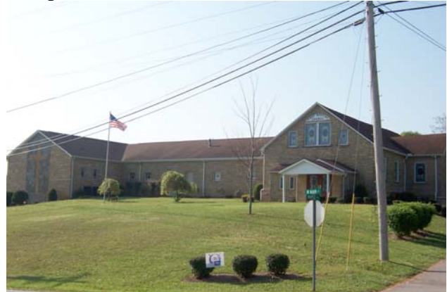
First Baptist Church at corner of Maple and Main