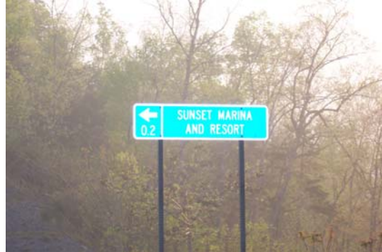
Signage directing travelers off Hwy 111 to a recreation area that includes two restaurants (Moogies and Sunset), a marina, beach area, and campground, Lodging in this area also includes the “SunCatcher” Lakeview Vacation Rental.