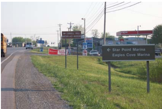
Signs directing visitors to Cordell Hull birthplace, Star Point Marina and Eagles Cove Marina