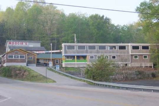
More signage on Hwy 111 to turn off and visit Moogies Restaurant (Open Wed, Fri. Sat) next to Obey River Recreation Area and Sunset Marina.