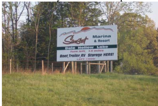
Billboard directing people to Sunset Marina and Resort on Dale Hollow Lake