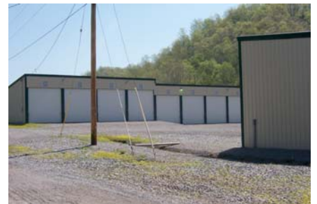
Boat Storage Business