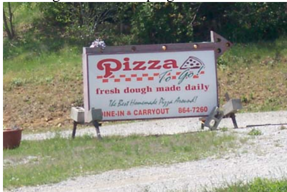
Pizza to Go on Hwy 111