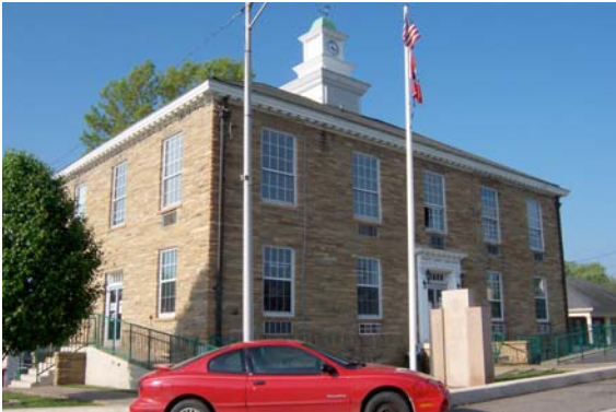
Pickett County Courthouse