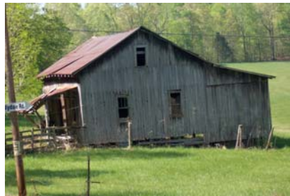
Another building that might be moved to the site and interpreted.