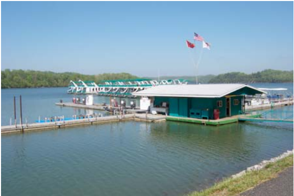
The marina at Eagle Cove offers “Big Foot” Houseboats are for rent.

Two brown signs on Hwy 325 directing travels which way to turn to head towards Star Point Marina and Eagle Cove Marina.