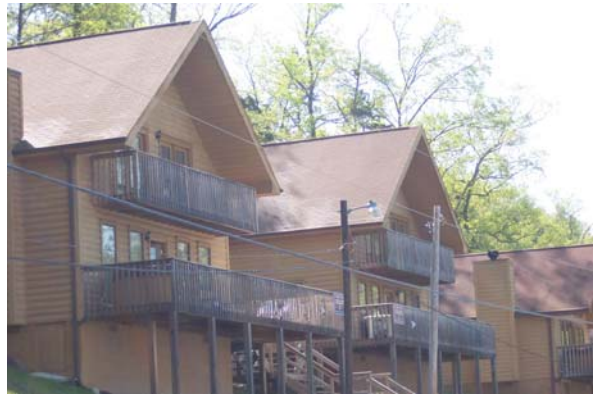
A few of the chalets available to rent at Eagle Cove on Dale Hollow Lake.