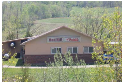
The Red Grille is popular in the evenings and includes food and music ( across from Farm House )