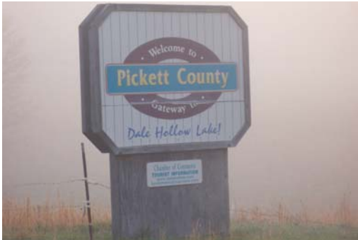
Welcome Sign as one enters County