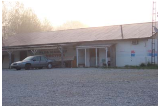
County Line Flea Market and Auction