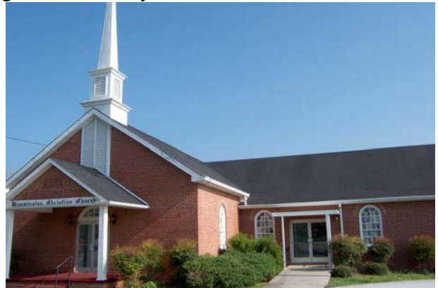
Christian Church along the route