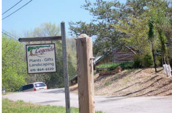
Just up the hill from The Grill off Hwy 111 is Legends Landscaping and Gifts.