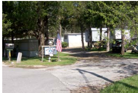
Silver Bell Group Subdivision