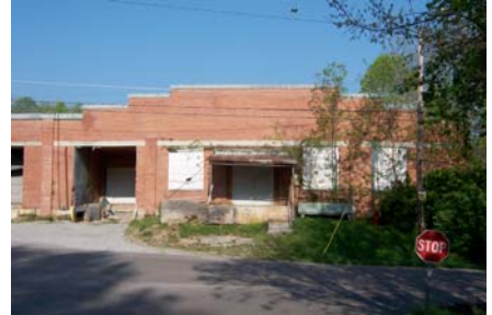
Closed Factory – Great potential for re-use