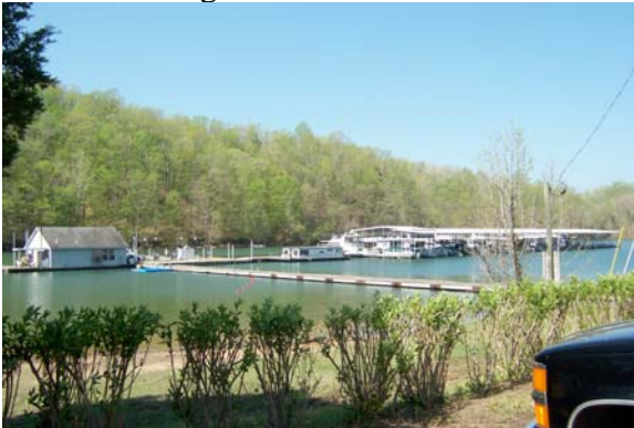
View of marina at StarPoint

StarPoint Resort describes itself as a fishing camp-vacation resort on Dale Hollow.