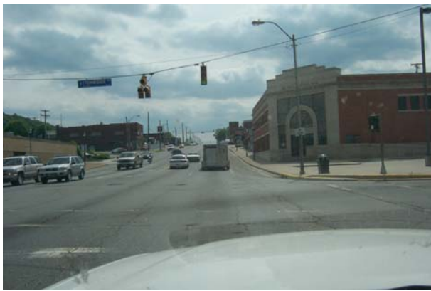
At the intersection of Indiana Road

Cumberland Trail (Linear) State Park is located just off Hwy 25