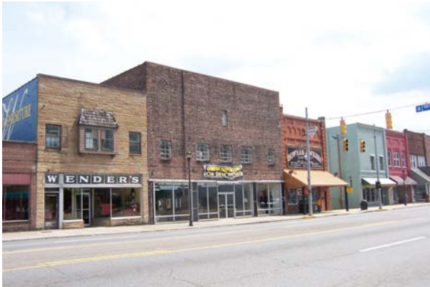
Another view at the intersection of 1 st Street of downtown La Follette, TN