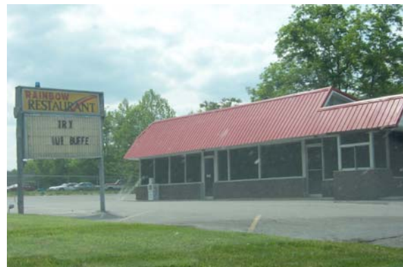
Two of numerous restaurants closed once one drew close to downtown La Follette