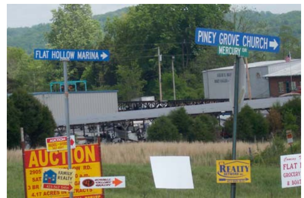
These signs indicate that there is both a marina and a church down this road (mm 17)

From mm 10 to the county line (mm 19) there is a gas station every 3 to 4 miles. Other than a church at mm 10 and at 15, a bank at mm 12 and two small marine shops/boat stores, there is nothing except beautiful views and a few farms.