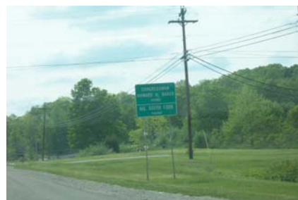
Sign denoting Hwy 63 as Big South Fork Parkway