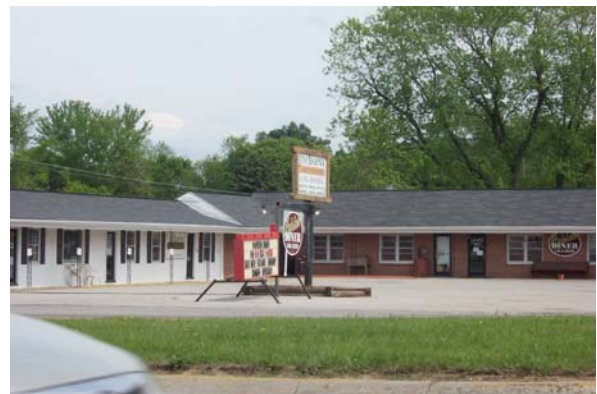
Sharp's Motel (mm 27) was the only lodging past this point on Hwy 63. All others had converted into other use such as this one next door that included a real estate agency, diner and a shop or two.