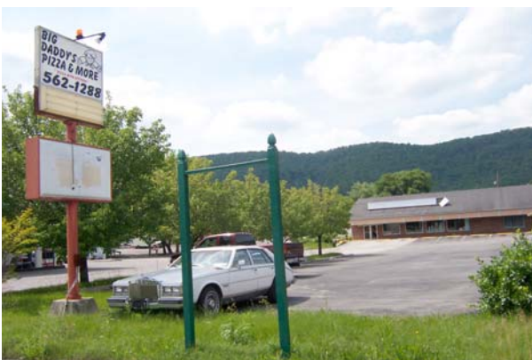
Here is another restaurant that has closed.