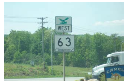
The bird is Tennessee's symbol for designated state scenic byway