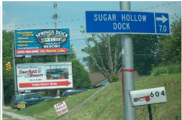
Sign and billboard just before Long Hollow Road