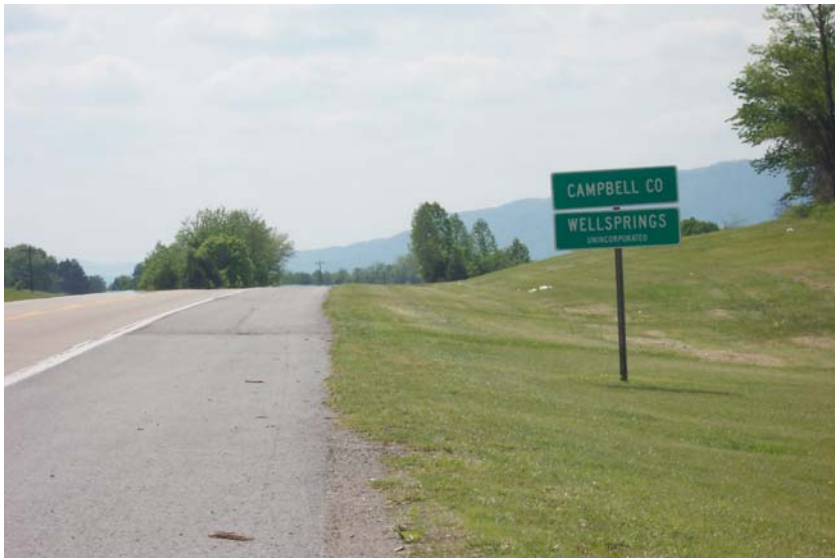
The eastern end of Campbell County begins at mm 19 within the unincorporated community of Wellsprings.