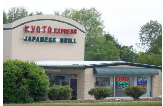
The only restaurants that seem to thrive other than the fast food restaurants on Hwy 24 are an Italian, Japanese and Chinese Restaurant. All others have closed.