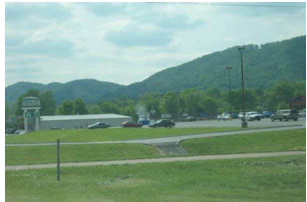
Valley View Plaza at mm 8 includes a Dollar General, grocery store, floral shop and a few other businesses.