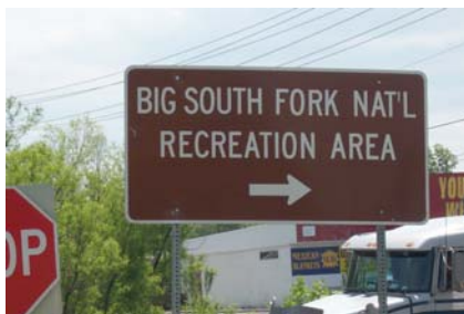
Sign as one takes I-75 at Exit 141

At Exit 141 at Hwy 63 was noted as the turn off for both Oneida (Scott County) and Huntsville. After turning onto Hwy 63 and heading west, I discovered it was also called Big South Fork Parkway and was designated a Scenic Byway. Also at this exit was a Comfort Inn, two gas stations, two firework stands, and both Subway and Perkins restaurants.