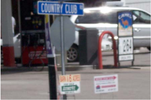
Almost all street signs are named for what one will find down that particular road. The Country Club is at the end of this road.