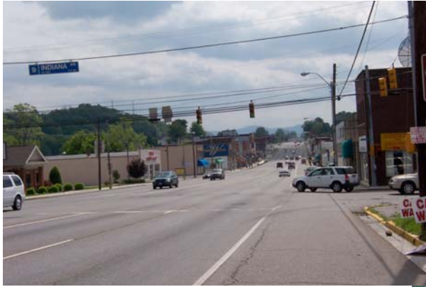
View looking westward

Two views of downtown La Follette at the Tennessee Road where Hwy 25 separates from Hwy 63 and heads north to Jellico.