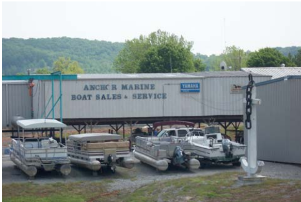
There are two marine boat shops along Hwy 63. Anchor Marine is at mm 17 and Rex's Marine is at mm 18.