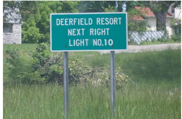
At the corner of 8 th Street, there is a sign for Deerfield Resort, a wedding chapel, two billboards promoting resorts and a directional sign to Sugar Hollow Dock