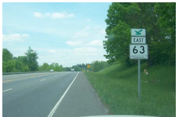
Both Highway 25W and Hwy 63 were noted as scenic byways.