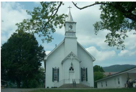
Wellness Methodist Church

Well Springs, an unincorporated community (mm 15) included a beautiful county church, a closed restaurant that was for sale, a general store and one other business.