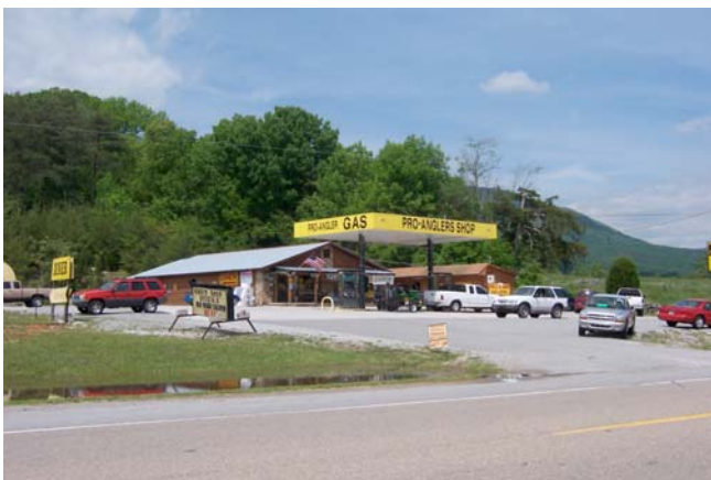
This gas station (mm 17) includes a bait shop, diner, beauty parlor and groceries.

From mm 10 to the county line (mm 19) there is a gas station every 3 to 4 miles. Other than a church at mm 10 and at 15, a bank at mm 12 and two small marine shops/boat stores, there is nothing except beautiful views and a few farms.