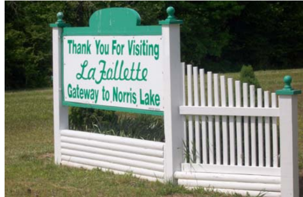
Welcome sign for La Follette at mm 9