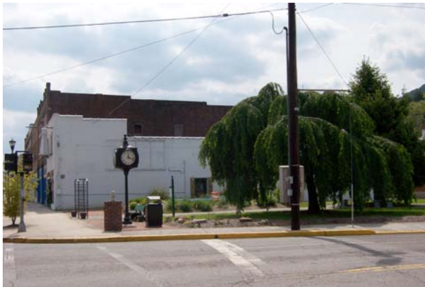
A small park in downtown La Follette.