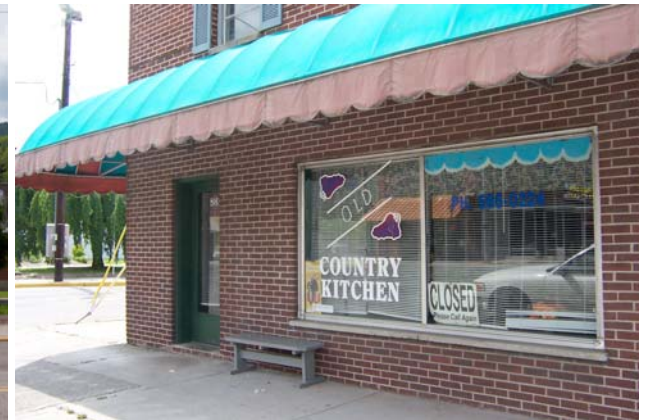
This was the only restaurant I noticed downtown. It is open from 5 am to 2 pm on weekdays and Saturdays from 5am to noon.