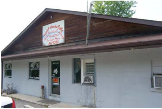
Light House Café is for sale