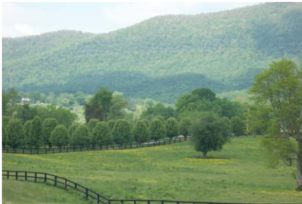
More breathtaking views along Hwy 63 (mm 16)