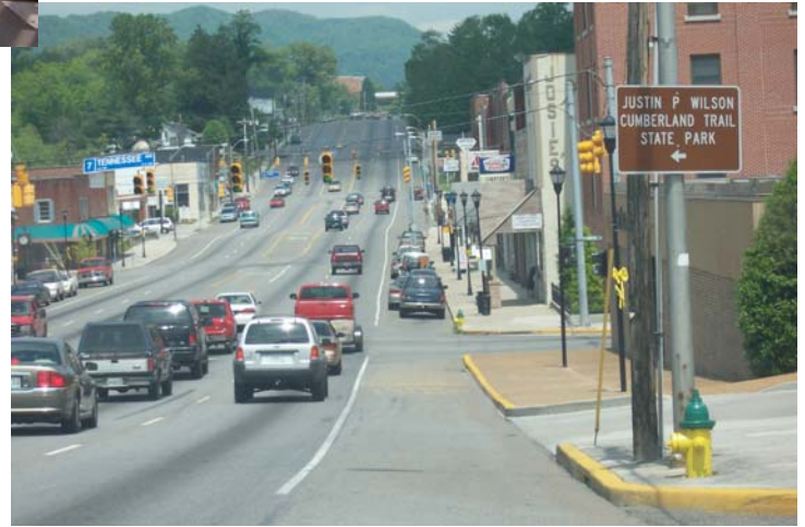
View looking east into downtown La Follette