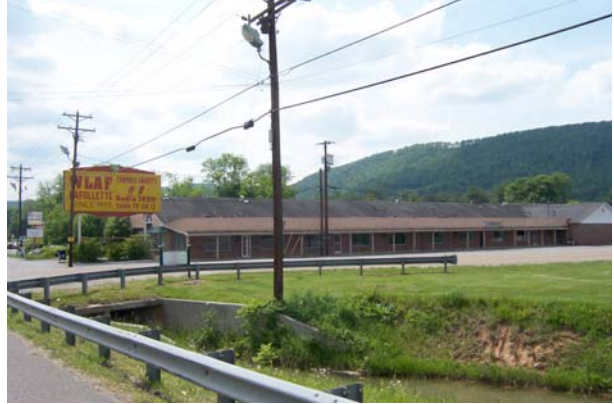
Across the street is a motel that is now closed. A section of it is open and serves as a laundry mat for the area.