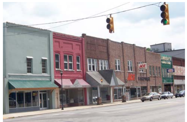
Two views of downtown La Follette