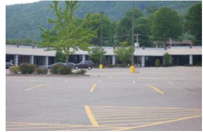
Peebles, Food City and a lot of empty buildings were located to a now empty Walmart Building

On the south side of Hwy 63 from mile marker 29 to 27 there was a gas station, Burger King, KFC, Sharp's Motel & Napoli's Italian Restaurant, a motel that had been converted into a diner and shops, Captain D's, Wendy, a mall with numerous shops including a Family Dollar, a Walgreen and a gas.