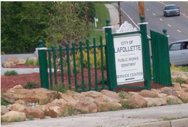
City Hall is located at mm 7 on Hwy 63