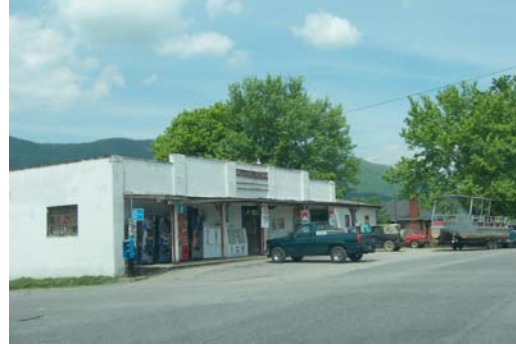
Crossroads General Store